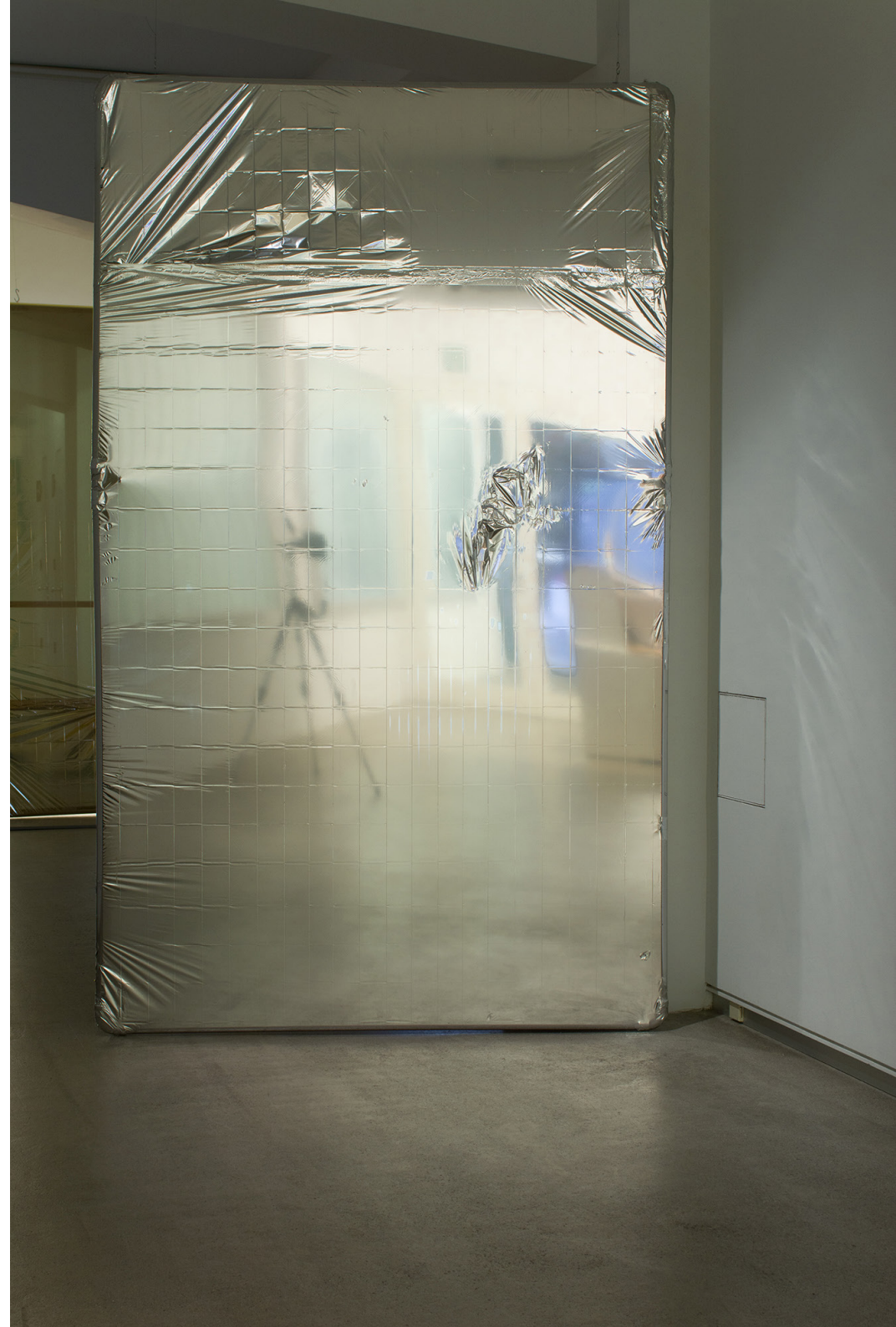
Without title, 2020 PVC, survival blanket (92% Polyethylene terephthalate (PET), 4% aluminum, 4% resin). 275,5 x 155 x 6 cm.