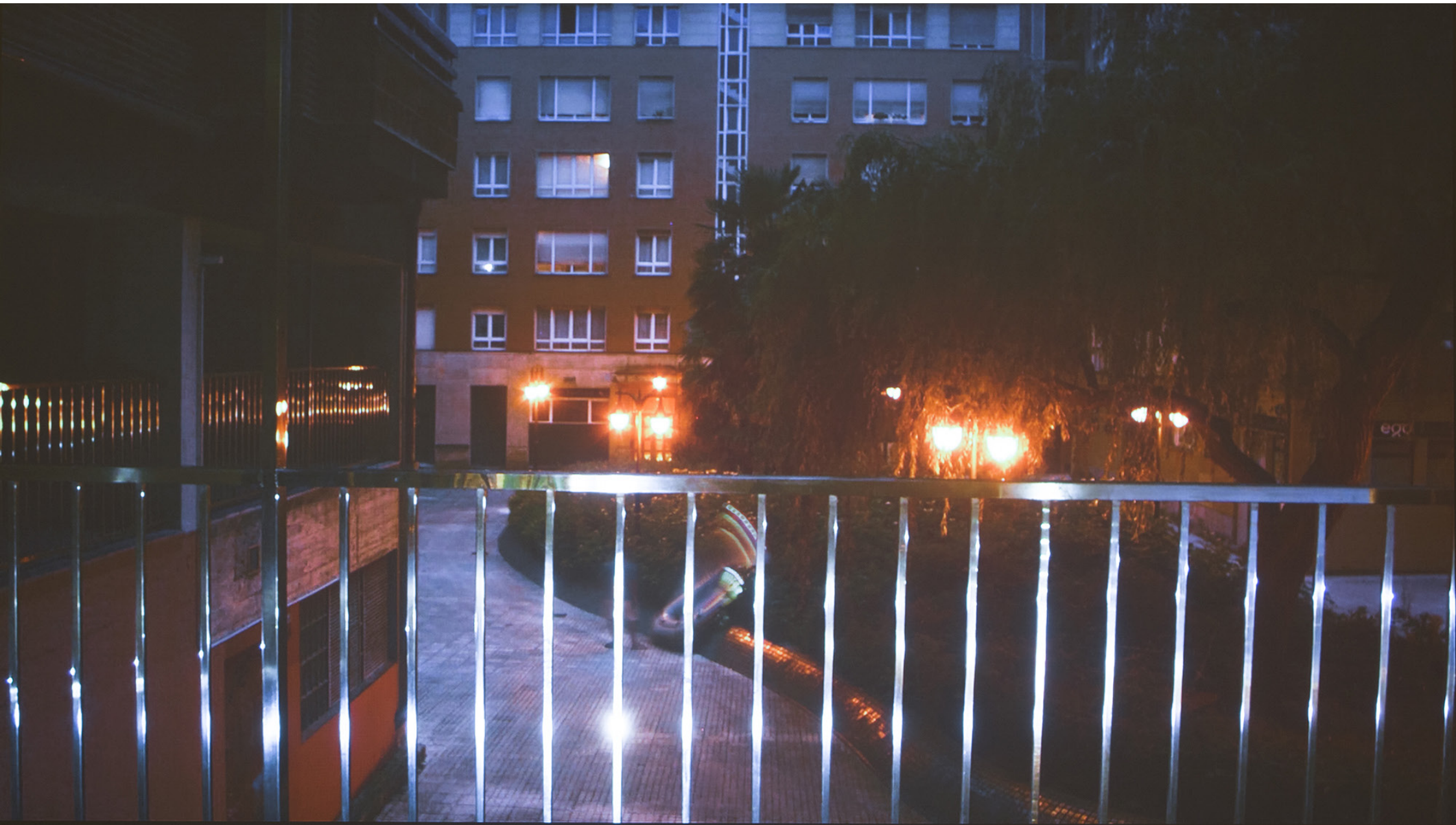
EXCURSION3 , 2020. HD video. 28'.