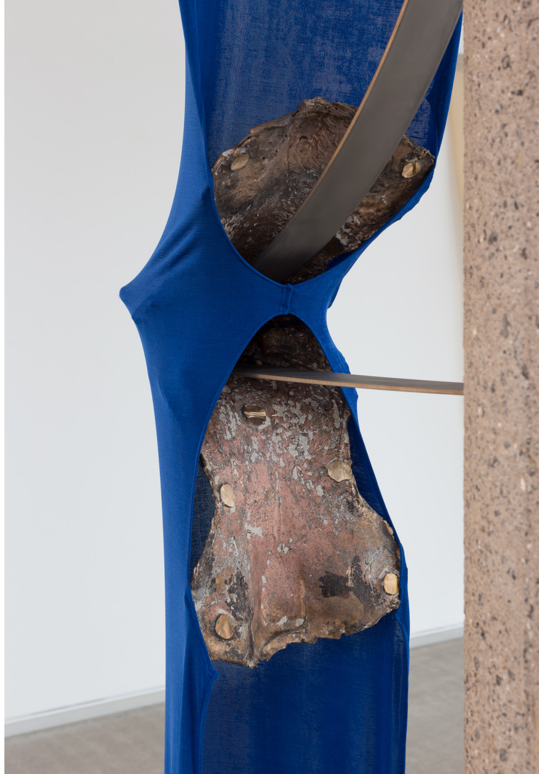
coctail 2022 Bronze, steel, ceramic coating, textile 326 x 100 x 70 cm.