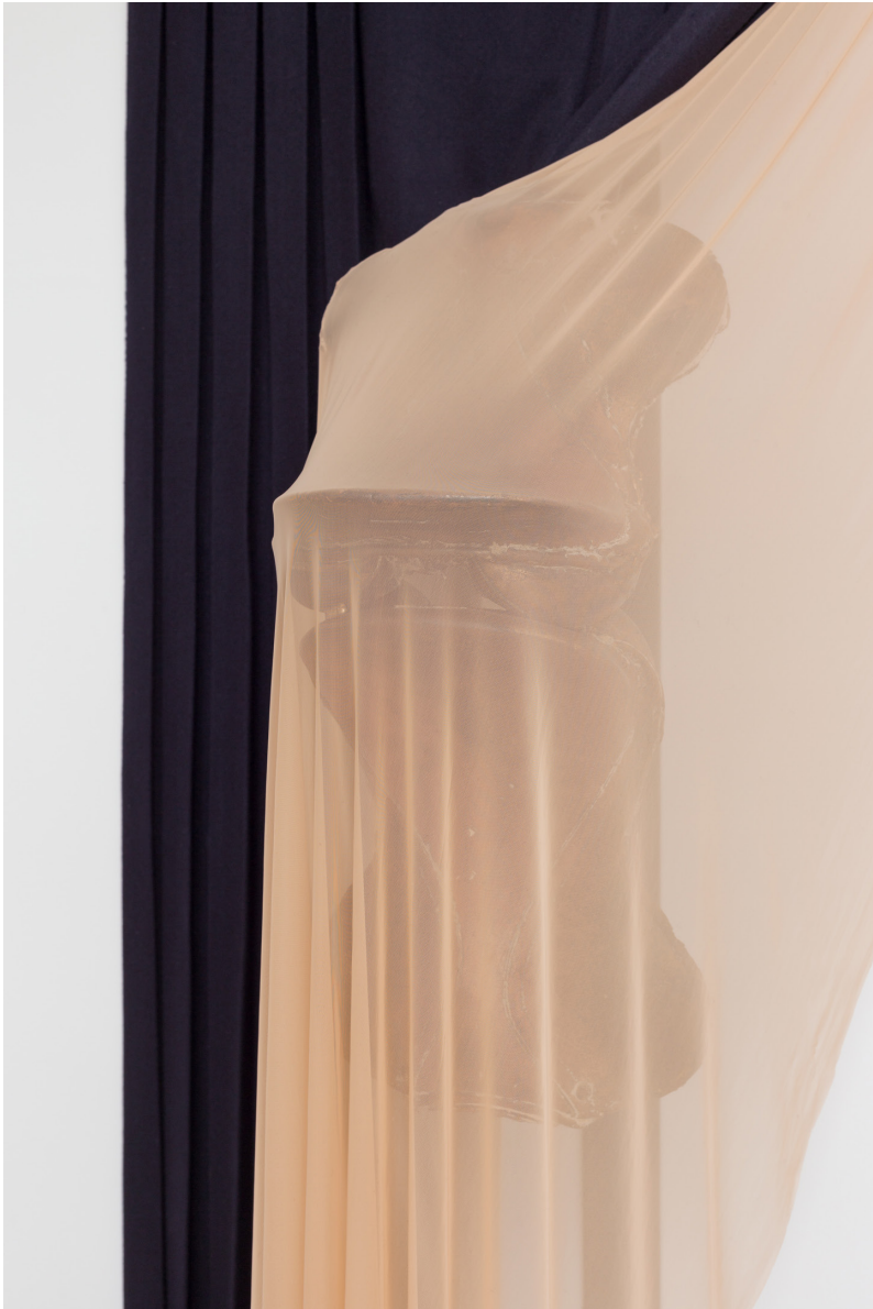
velos (inverno) 2022 Bronze, steel, ceramic coating, textile 243 x 106 x 70 cm.