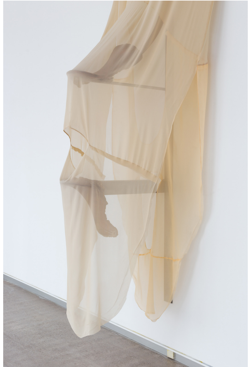
velos (verano) 2022 Bronze, steel, ceramic coating, textile 280 x 177 x 80 cm.