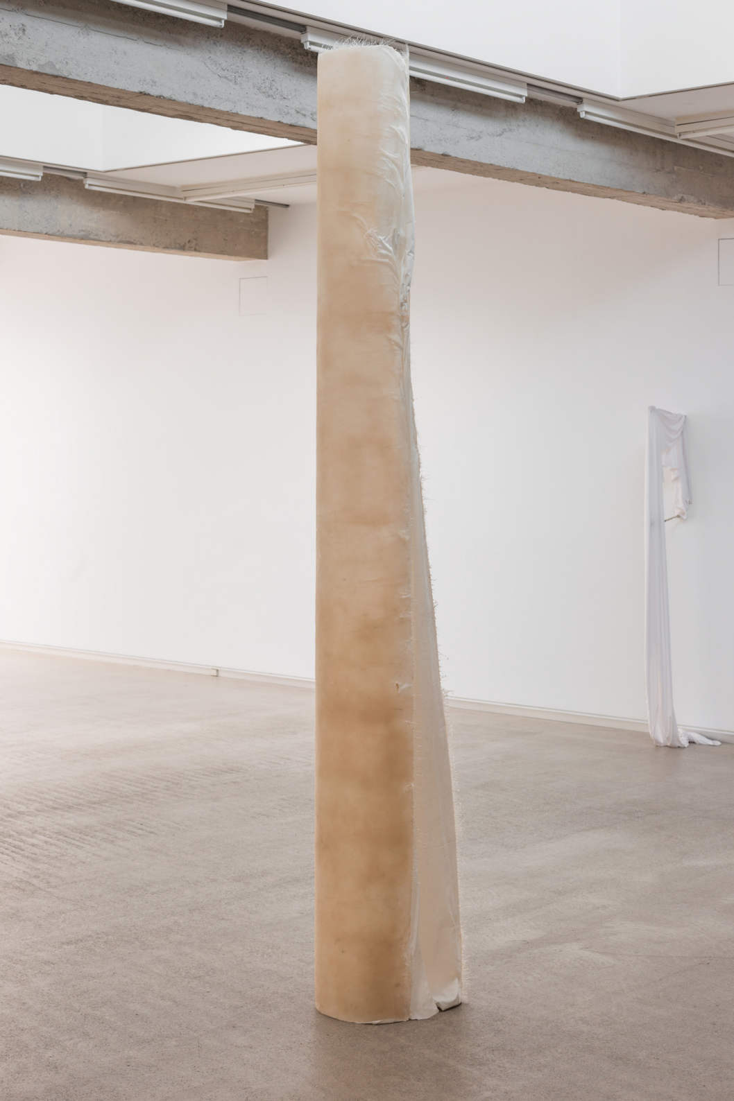
dividual , 2022 (detail) Polyester resin, fiberglass and plastic. 5 elements 3m. high, variable size of the installation