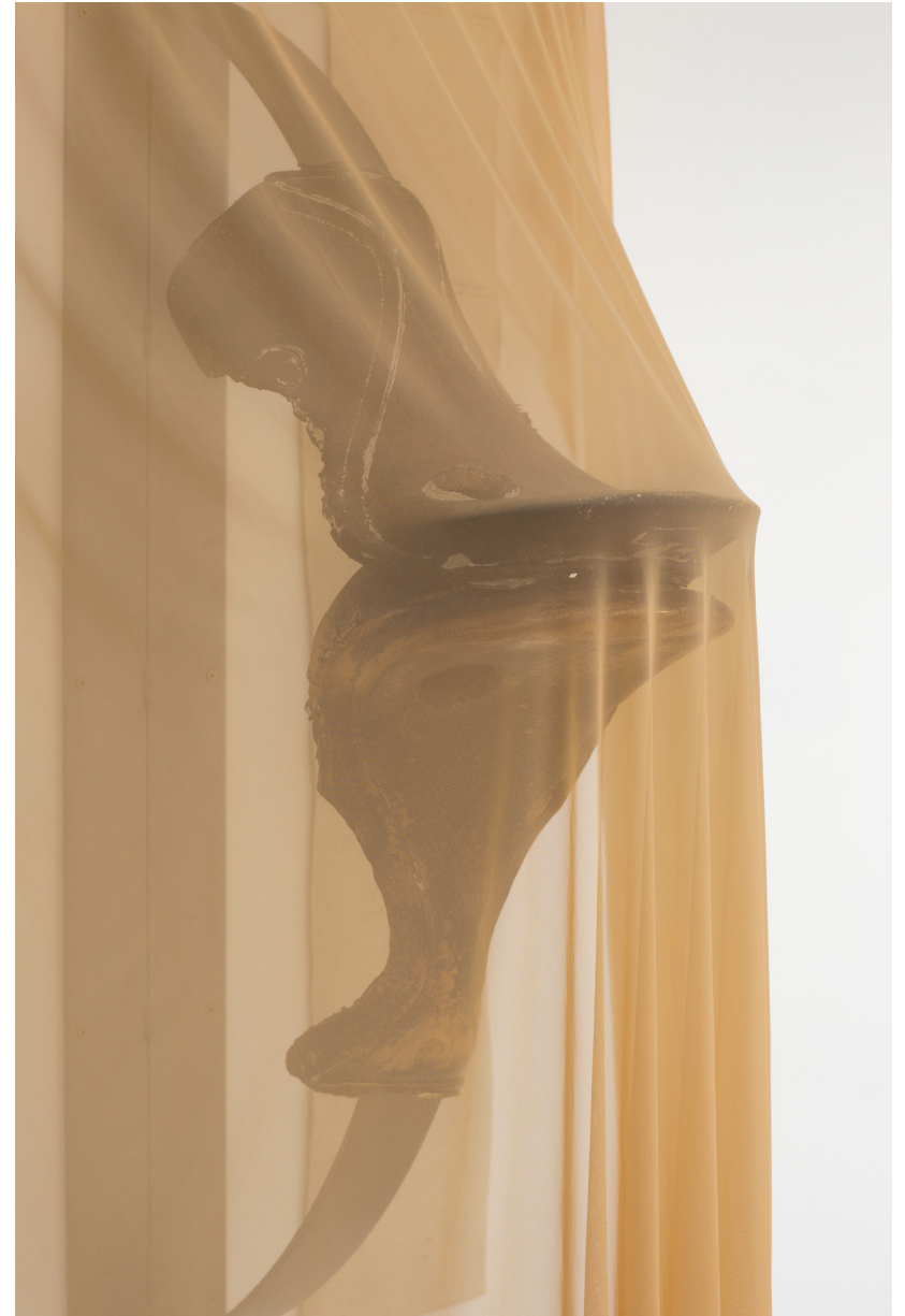
velos (primitiva) 2022 Bronze, steel, ceramic coating, textile 203 x 104 x 70 cm.