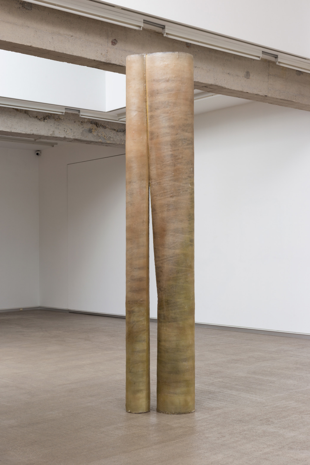
dividual , 2022 (detail) Polyester resin, fiberglass and plastic. 5 elements 3m. high, variable size of the installation