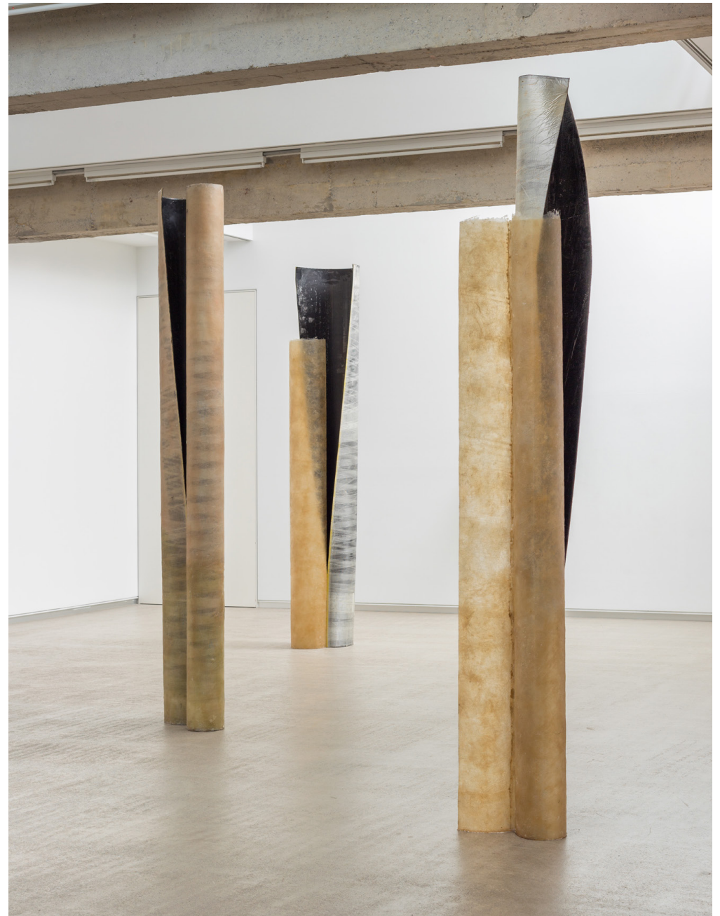
dividual , 2022 (detail) Polyester resin, fiberglass and plastic. 5 elements 3m. high, variable size of the installation