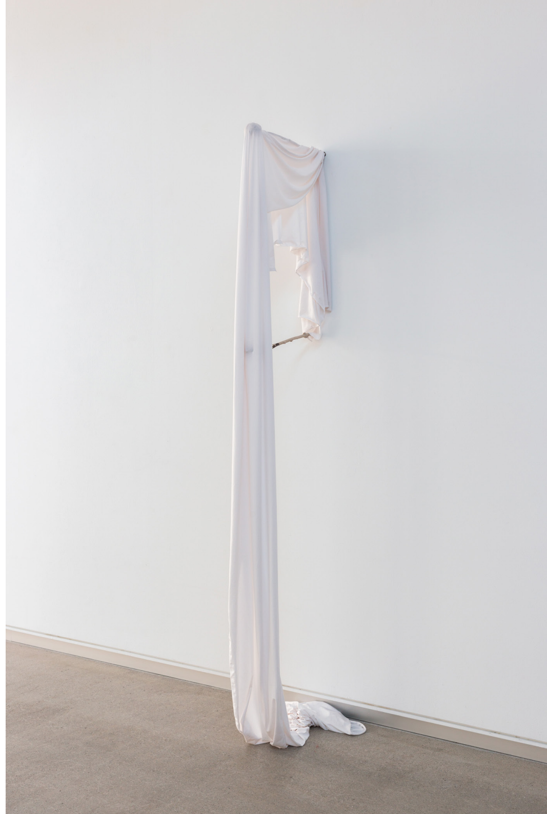
pulso 2022 Bronze, ceramic coating, textile, dried flower 166 x 15 x 48 cm.