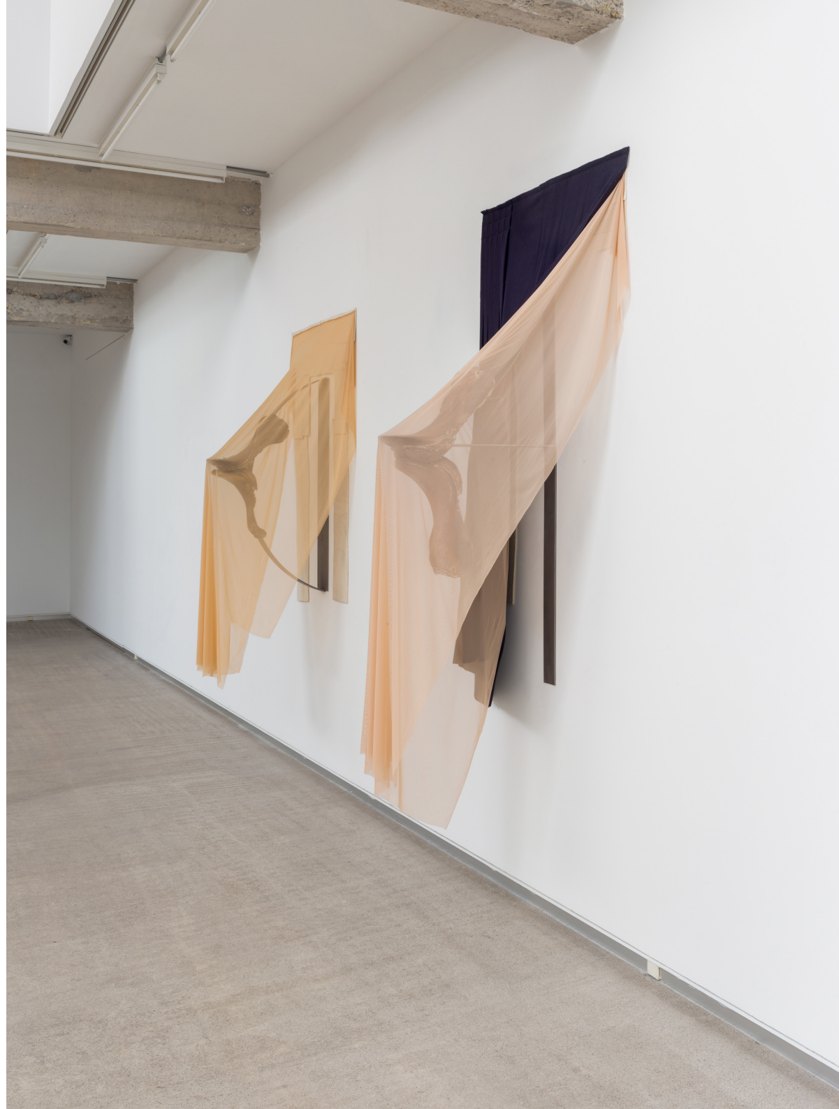
Vista de instalación