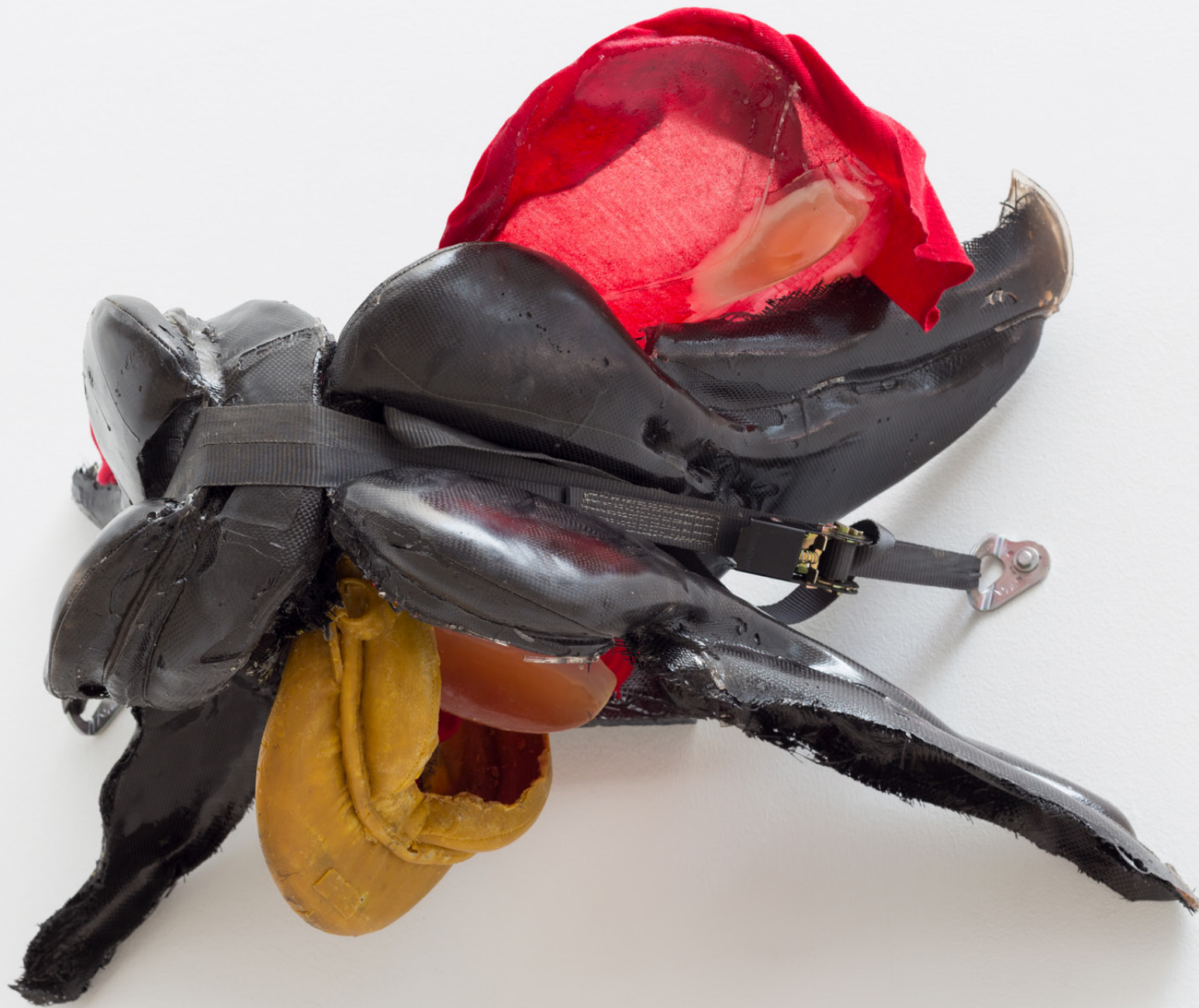
bostezo 2022. Wax, polyester resin, carbon fiber, fiberglass, textile, webbing. 55 x 82 x 47 cm.