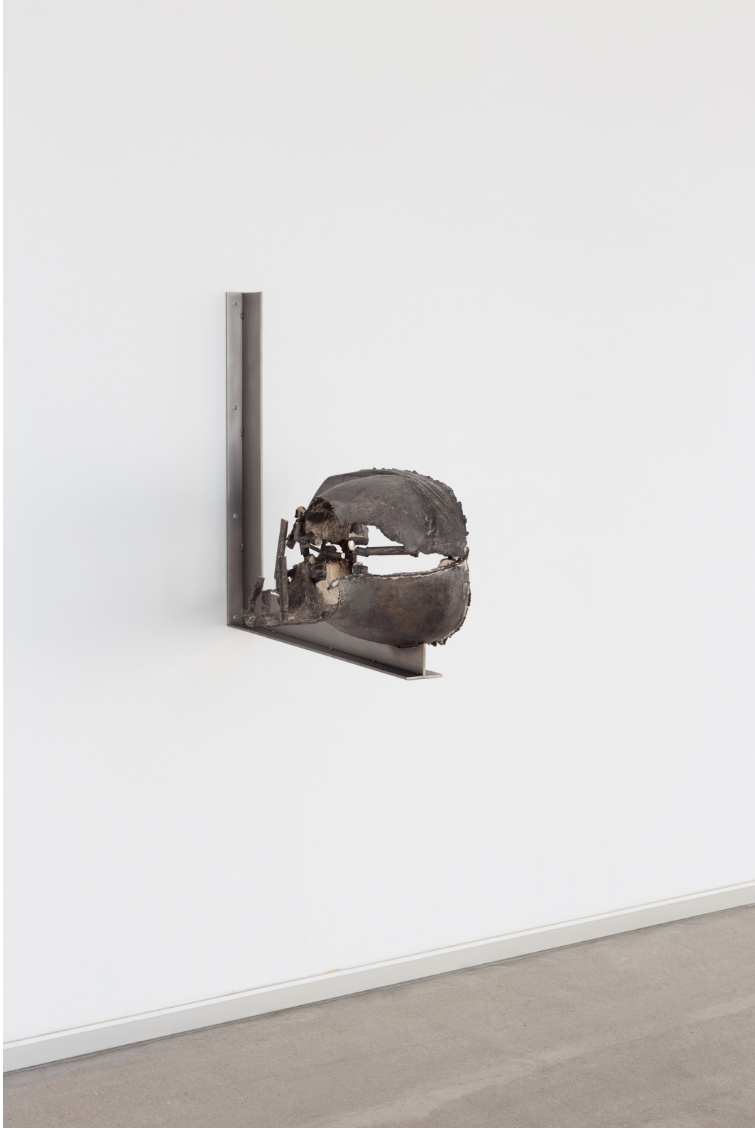
óptico 2022 Steel, ceramic coating 75 x 30 x 87 cm.