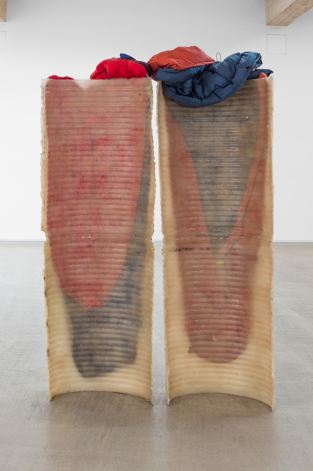
am I am object 2022 Polyester resin, fiberglass, sleeping bags 195 x 126 x 30 cm.