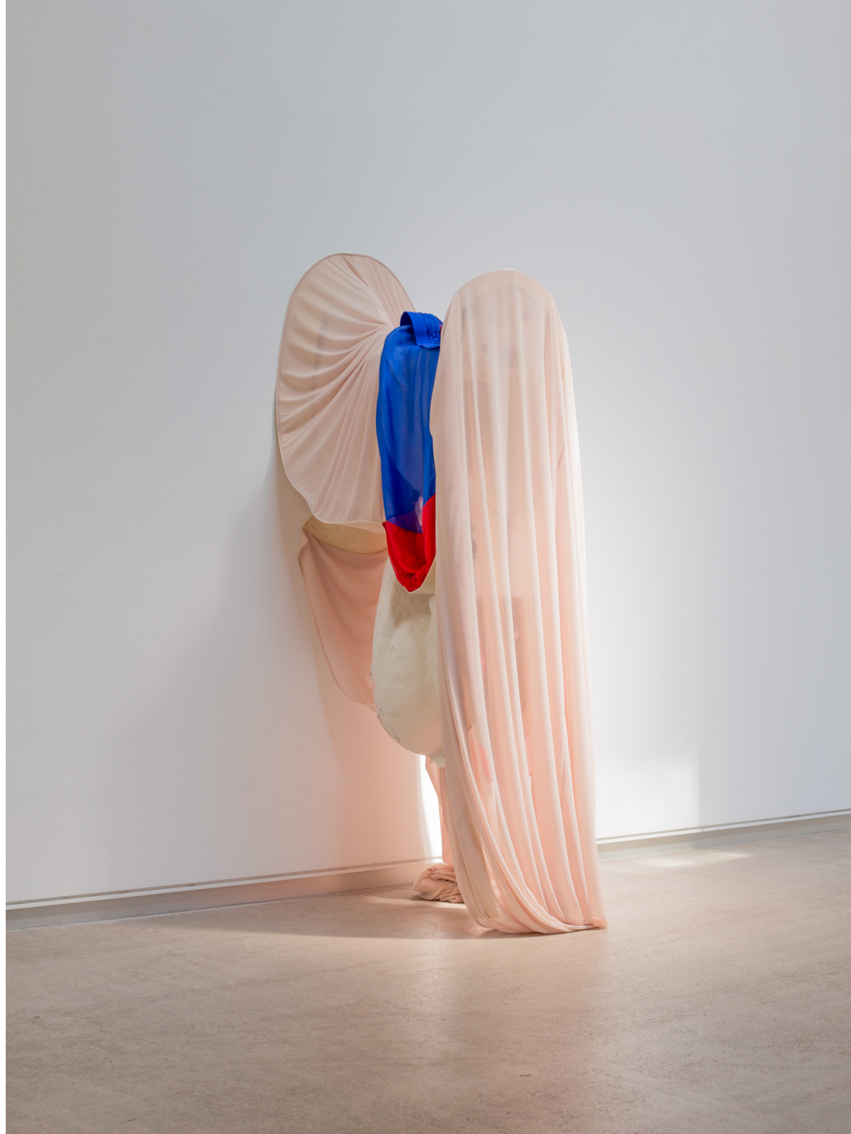
velos (párpados) 2022 Acrylic resin, fiberglass, textile 192 x 48 x 85 cm.