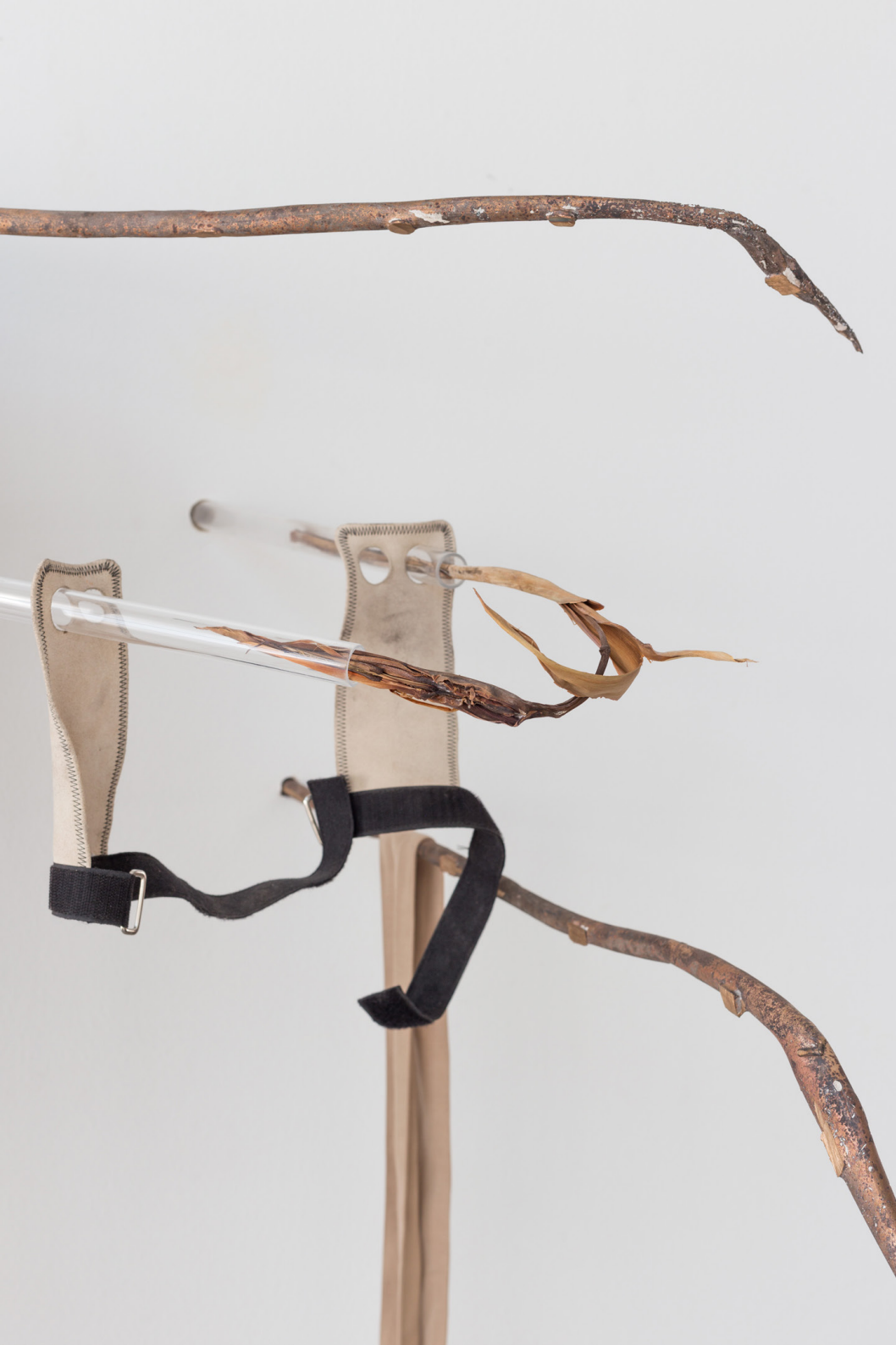
pulso 2022 (detail) Bronze, methacrylate, dried flower, gabardine 155 x 66 x 76 cm.