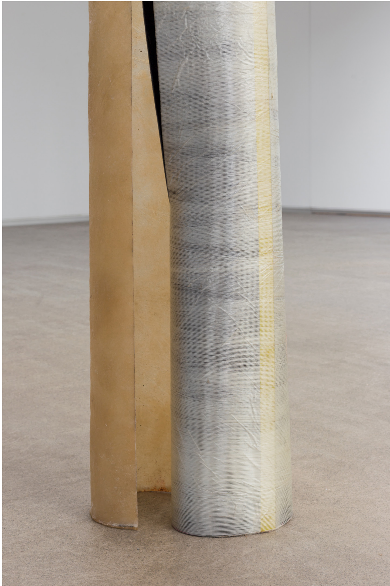
dividual , 2022 (detail) Polyester resin, fiberglass and plastic. 5 elements 3m. high, variable size of the installation