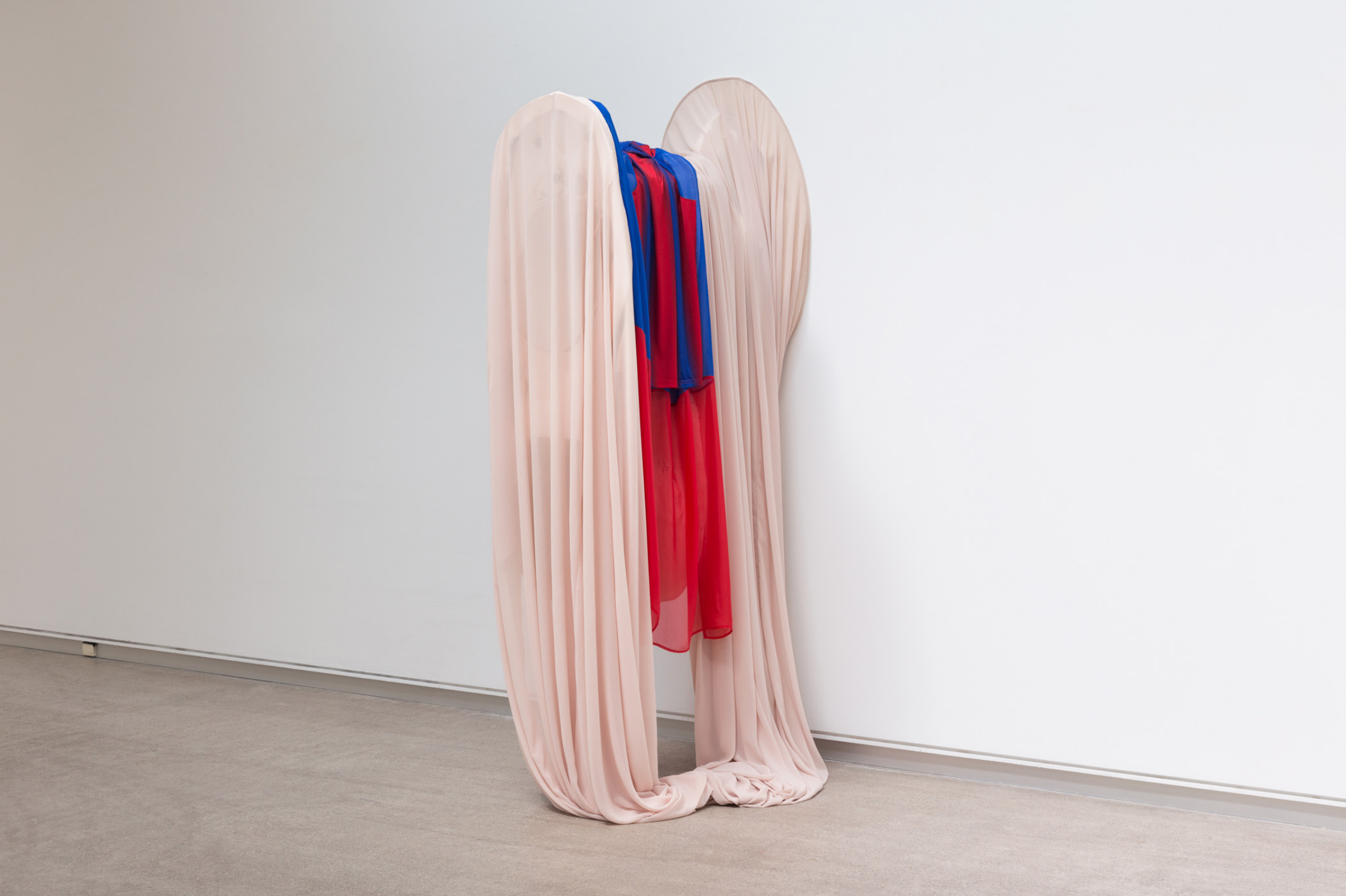
velos (párpados) 2022. Acrylic resin, fiberglass, textile. 192 x 48 x 85 cm.