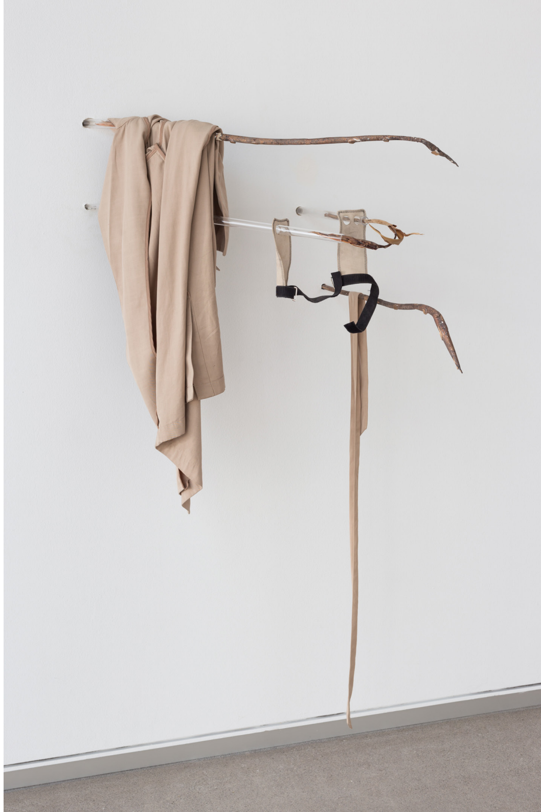
pulso 2022 Bronze, methacrylate, dried flower, gabardine 155 x 66 x 76 cm.