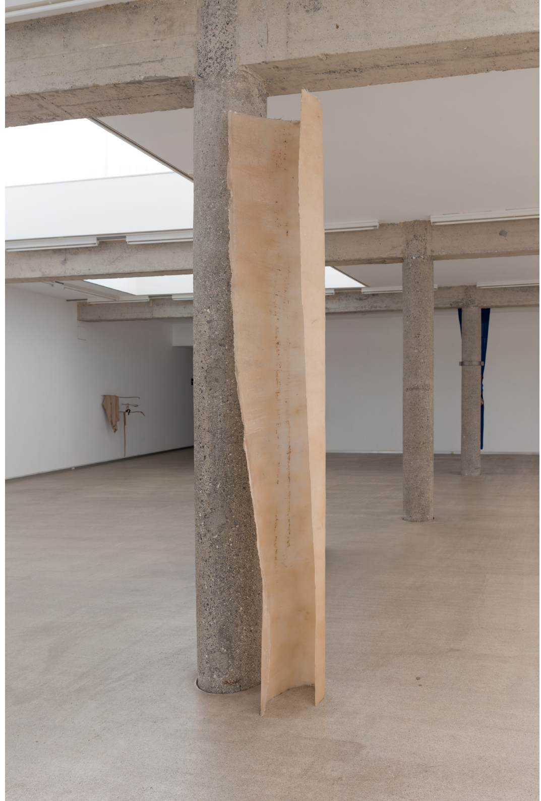
dividual , 2022 (detail) Polyester resin, fiberglass and plastic. 5 elements 3m. high, variable size of the installation