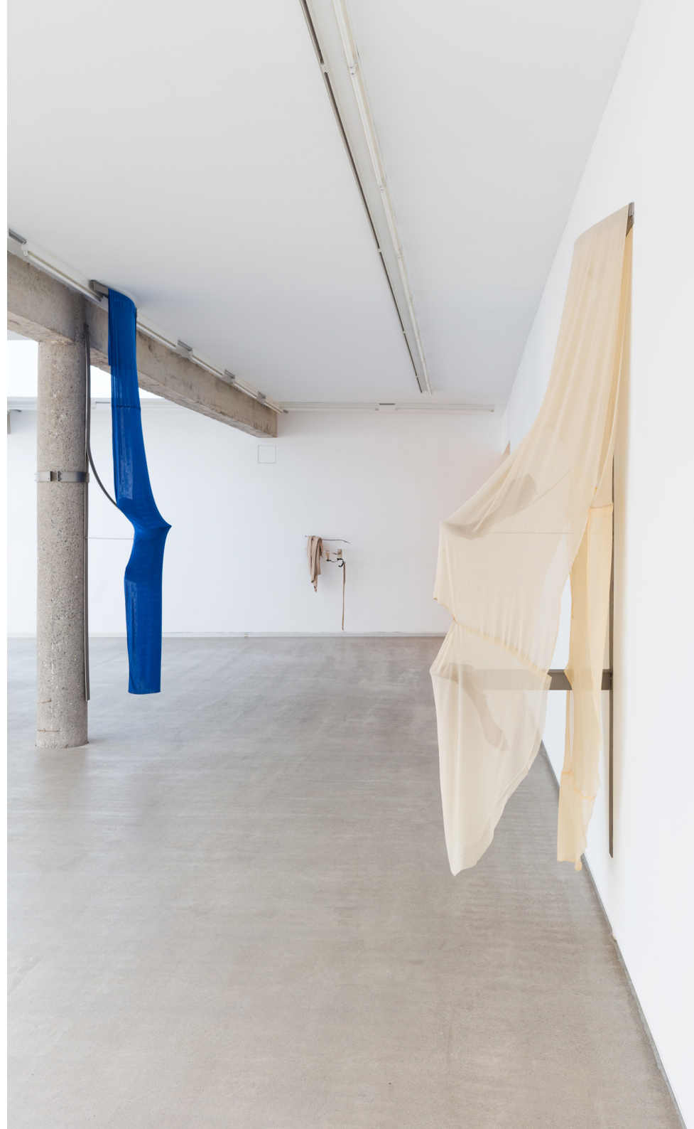
velos (verano) 2022 Bronze, steel, ceramic coating, textile 280 x 177 x 80 cm.