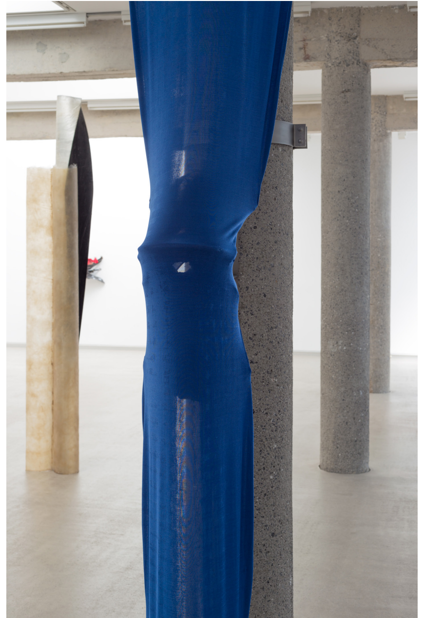
cocktail 2022 Bronze, steel, ceramic coating, textile 326 x 100 x 70 cm.