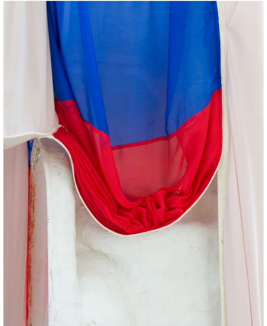
velos (párpados) 2022 Acrylic resin, fiberglass, textile 192 x 48 x 85 cm.