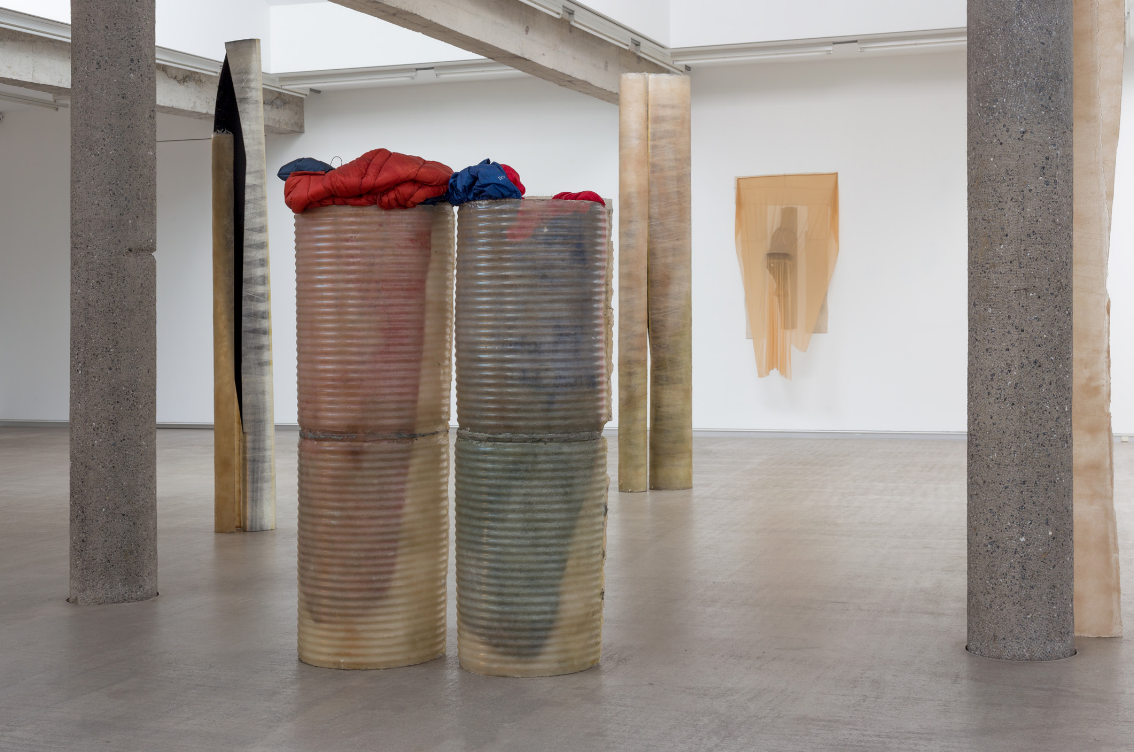
am I am object 2022. Polyester resin, fiberglass, sleeping bags. 195 x 126 x 30 cm.