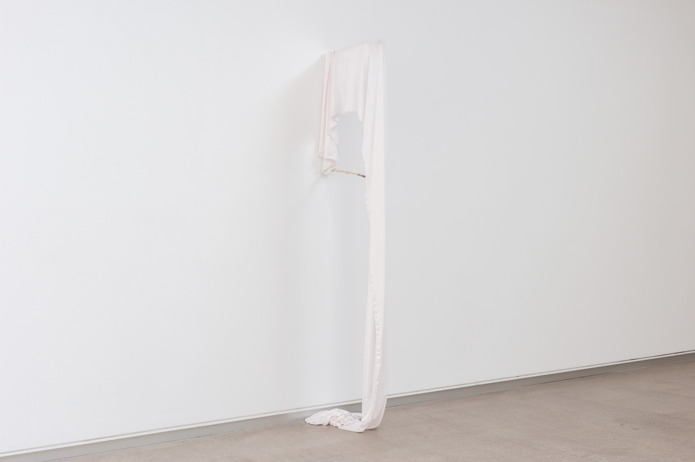
pulso 2022. Bronze, ceramic coating, textile, dried flower. 166 x 15 x 48 cm.