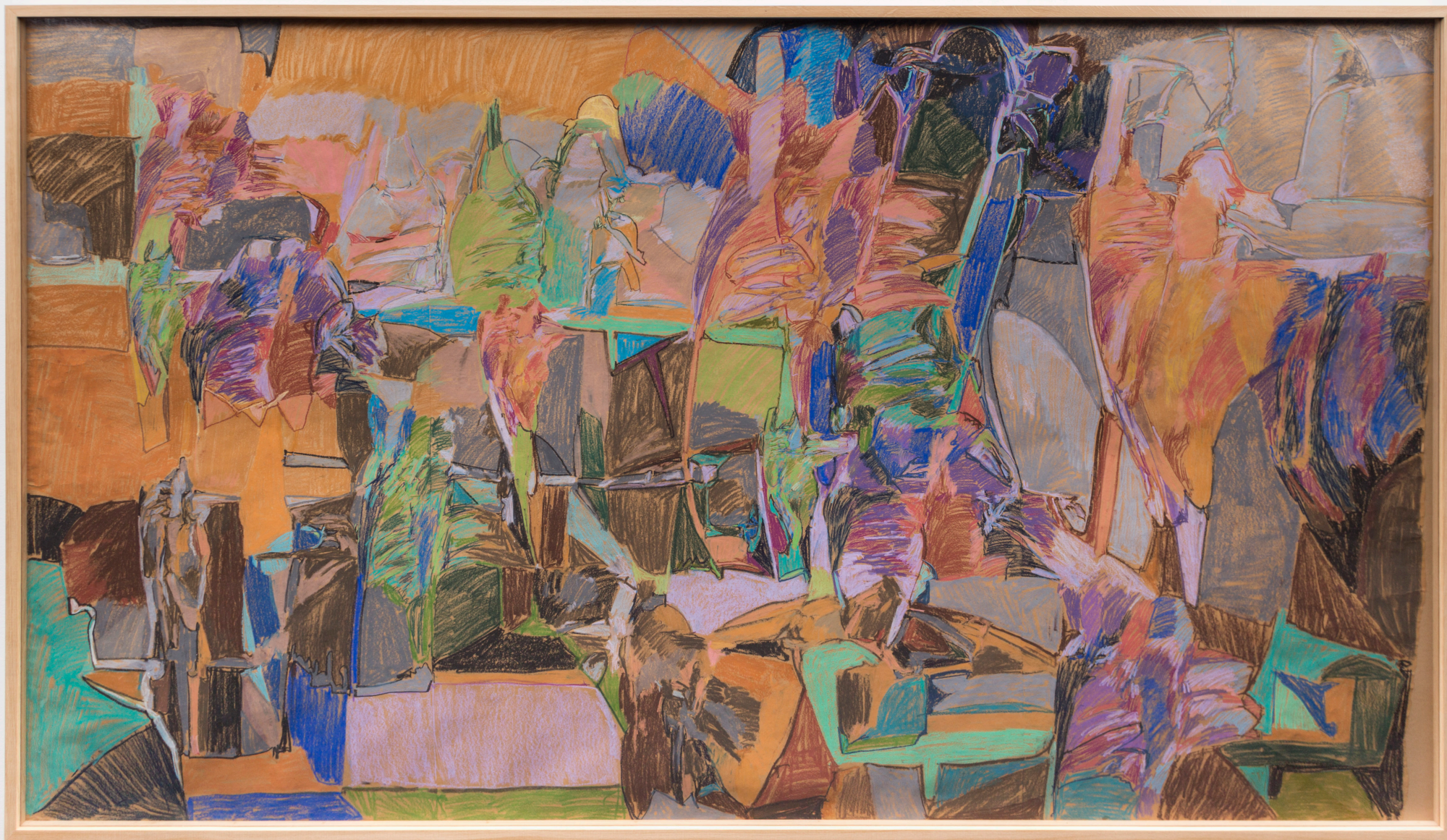
Composición. Pastel on paper. 168,5 x 273,5 cm.