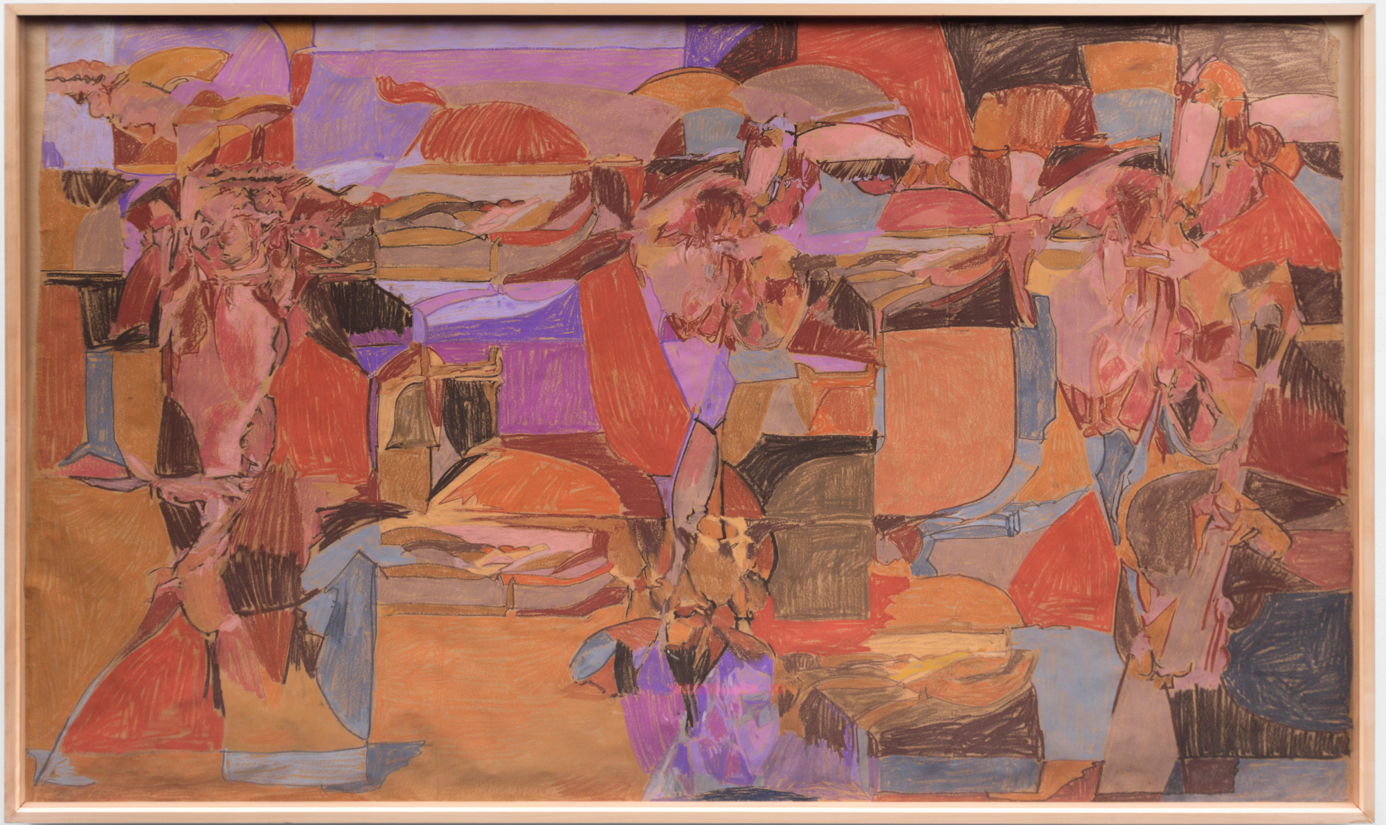
Composición. Pastel on paper. 168,5 x 282,5 cm.