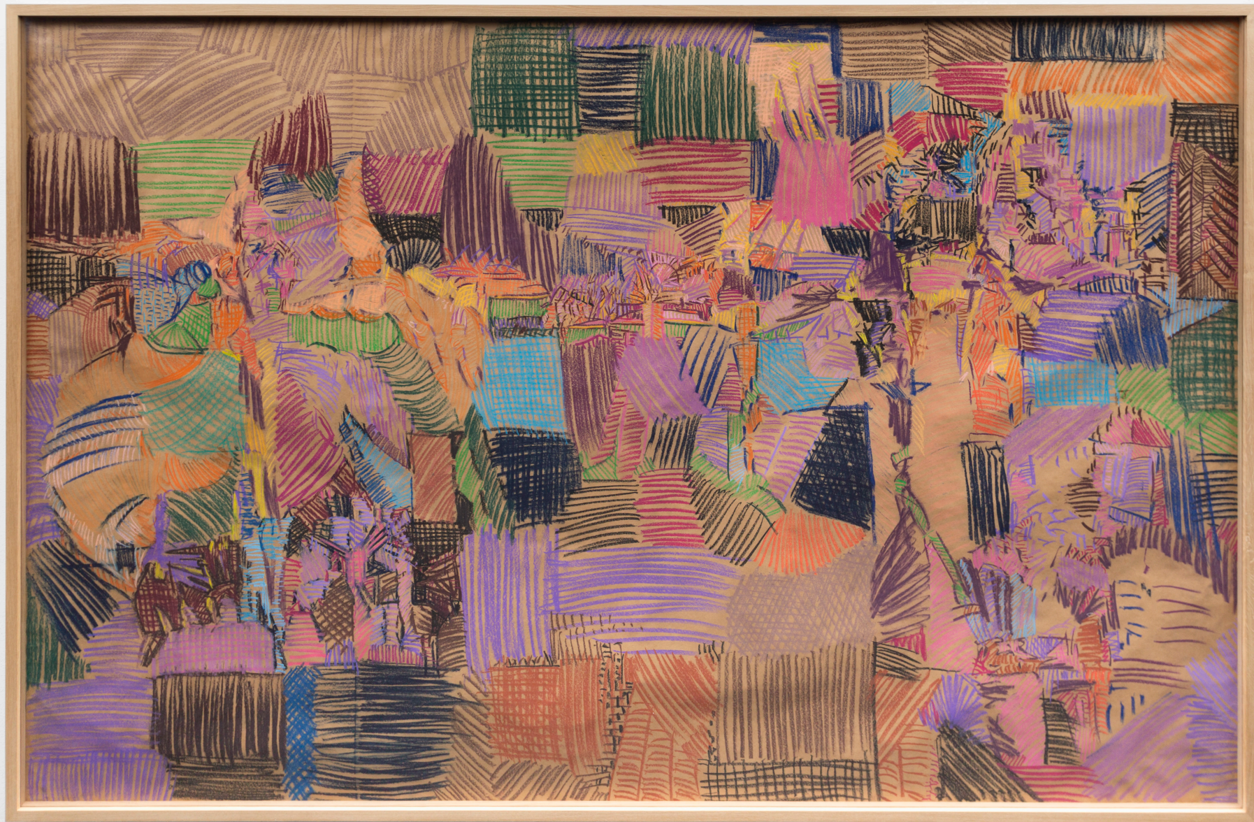
Composición. Pastel on paper. 168,5 x 255 cm.