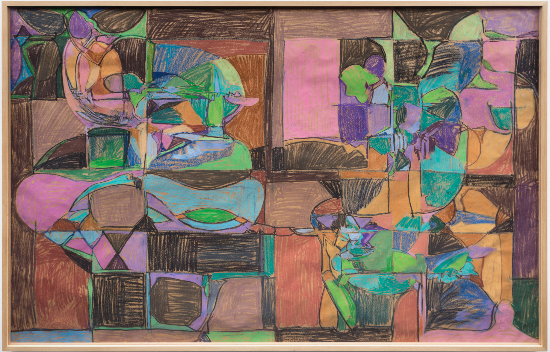
Composición. Pastel on paper. 168,5 x 266,5 cm.