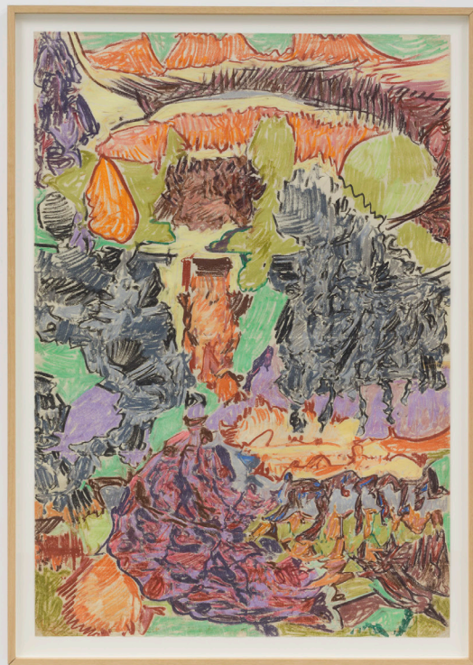
Composición. Pastel on paper. 161 x 110 cm.