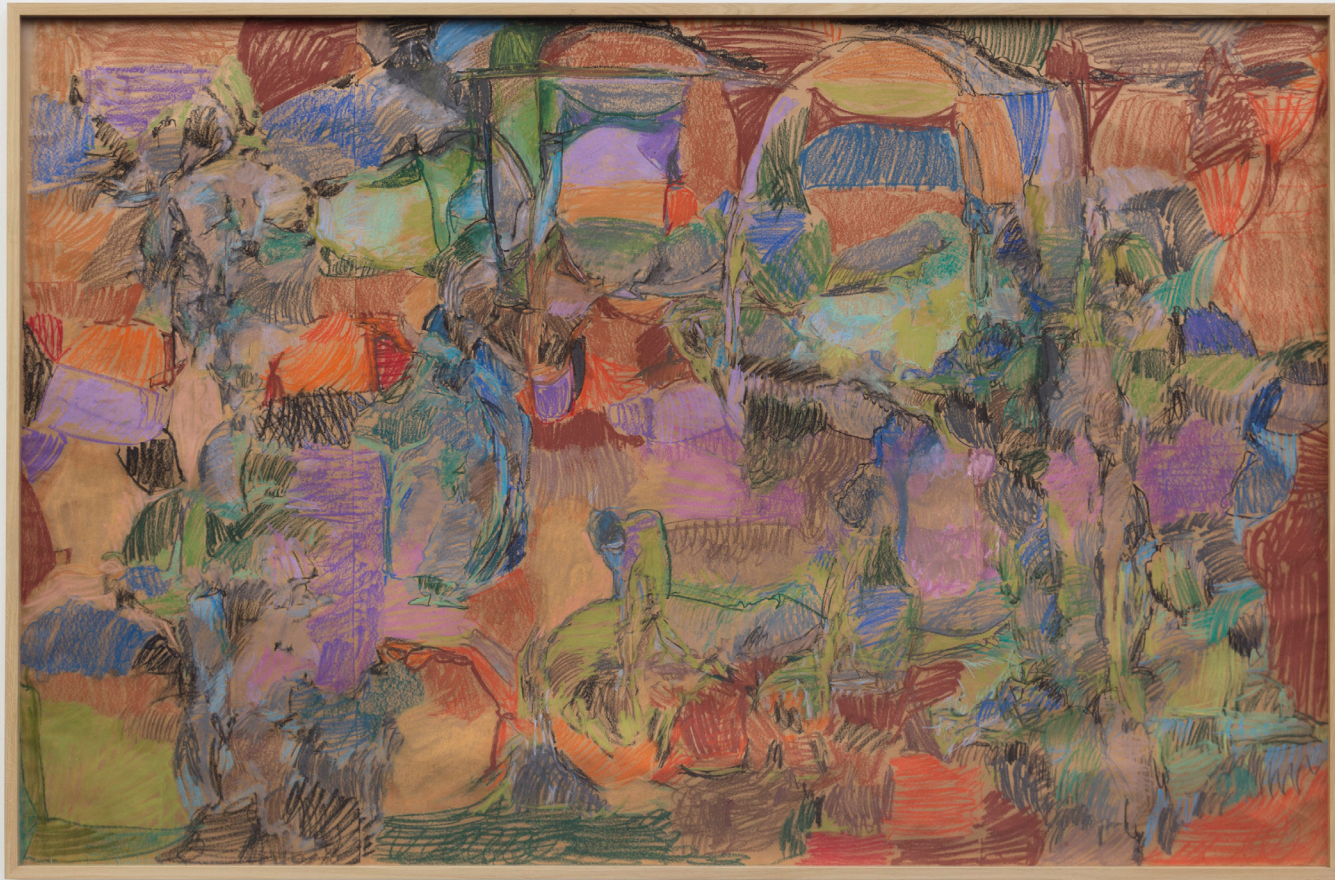
Composición. Pastel on paper. 168,5 x 260,5 cm.