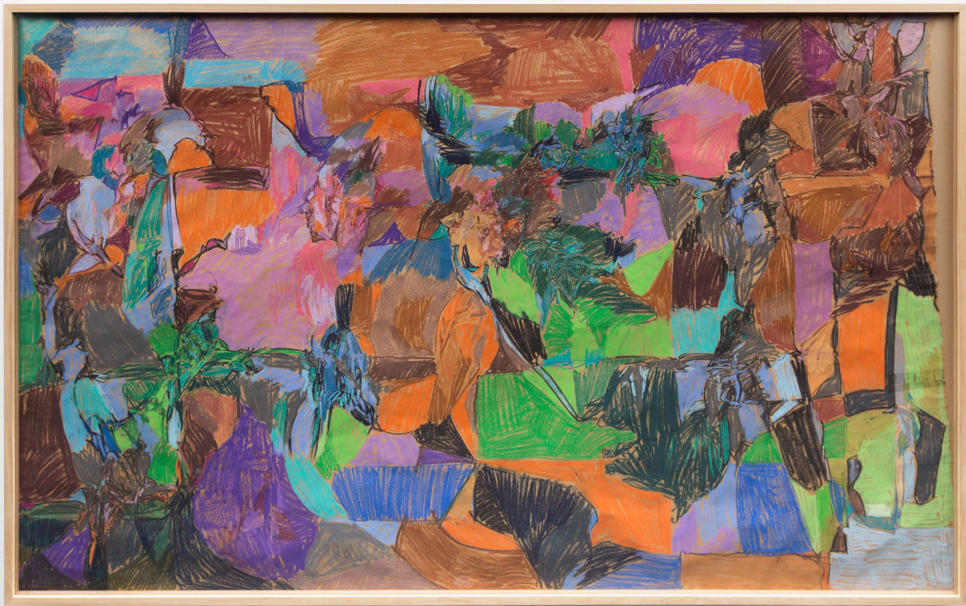
Composición. Pastel on paper. 168,5 x 273,5 cm.