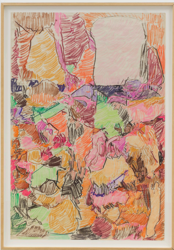
Composición. Pastel on paper. 161 x 110 cm.