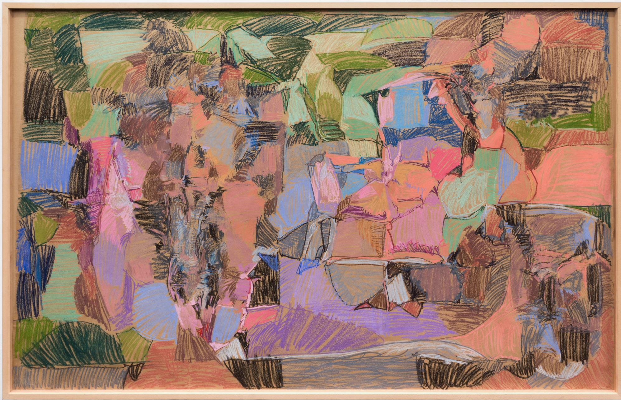
Composición. Pastel on paper. 168,5 x 250 cm.