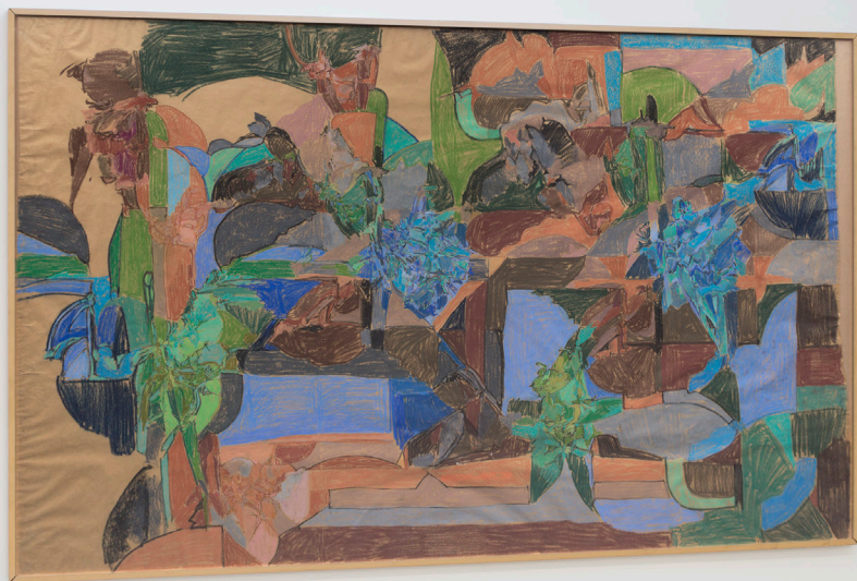
Composición Pastel on paper 168,5 x 278,5 cm.