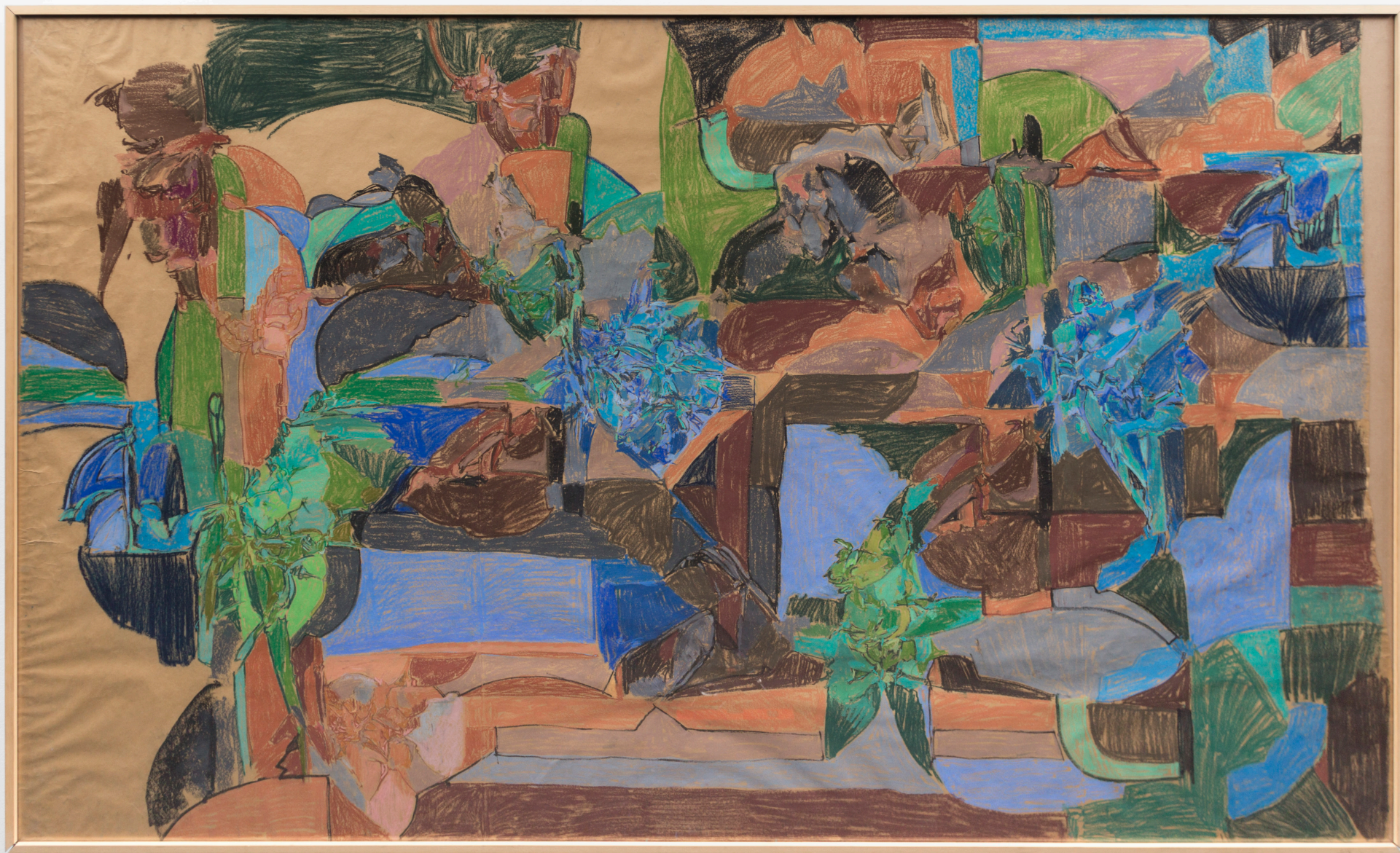
Composición. Pastel on paper. 168,5 x 278,5 cm.