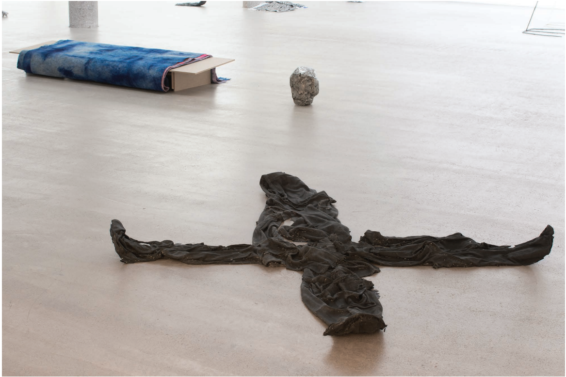
Bilbao (Cuadrilla) #17, 2017. Textile and silicone, 18x185x189cm