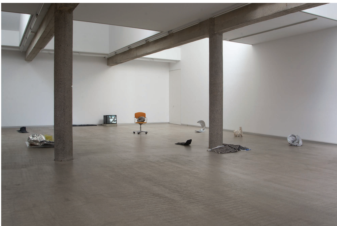
Bilbao (Isadora) #7 , 2017. Steel. Inox. 26x33x31cm Installation view