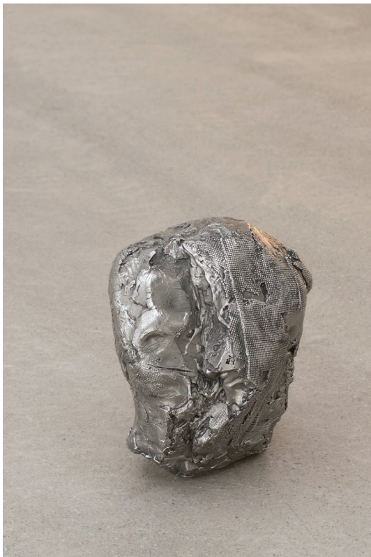
Installation view Bilbao (piedra) , 2017. Steel. Inox. 30x25x25cm