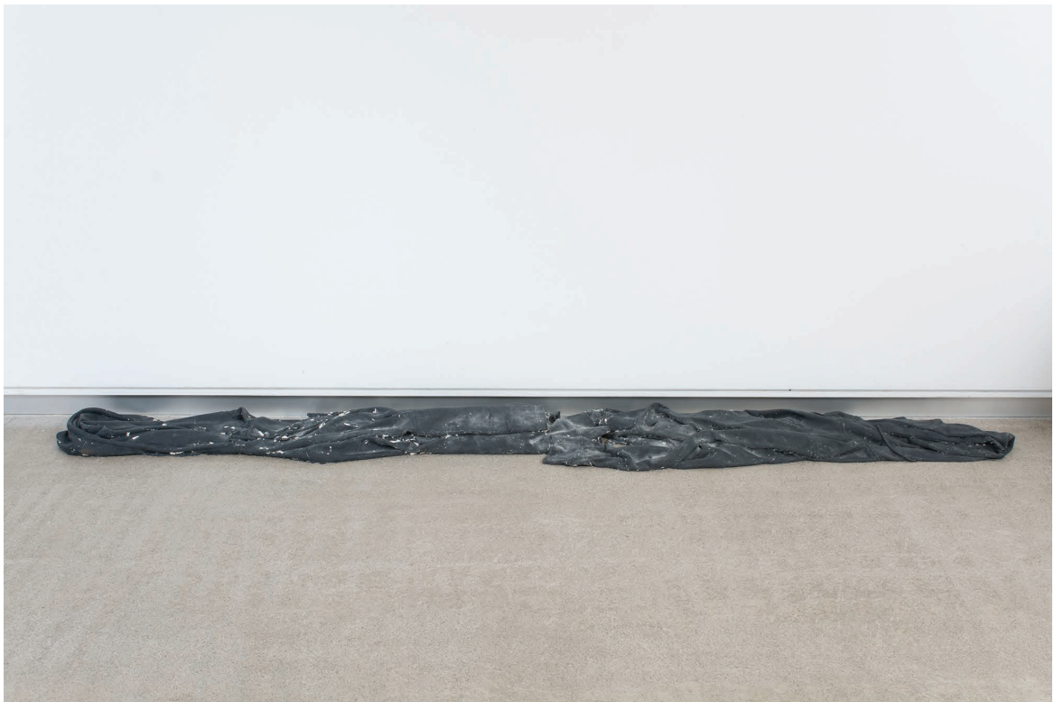
Forro , 2014. 16mm video. Bilbao (Cuadrilla) #20 , 2017. Textile and silicone, 25x220x10cm