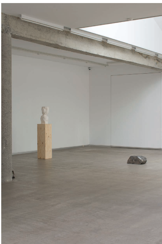
Bilbao (piedra) #5. 2017. Steel. Inox. 24x5x32cm Installation view