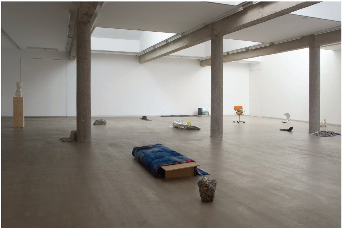
Bilbao (Cuadrilla) #19 , 2017. Textile and silicone, 20x65x36 cm Installation view