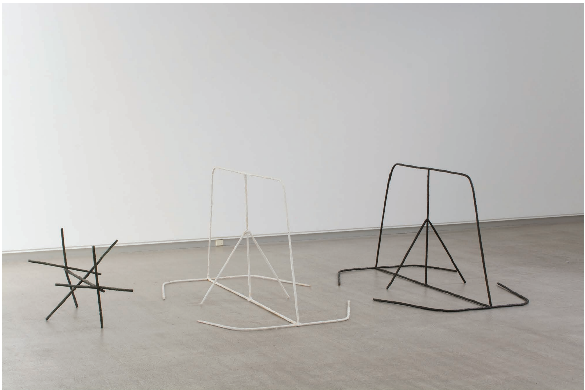
Installation view Bilbao (defensa #2/#3) , 2017. plaster, steel and bronze, variable dimensions.