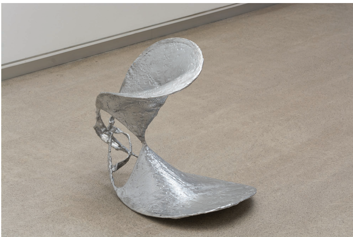
Vuscohh Vohhlver (Bilbao 10) , 2017. Aluminium, 33x45x52cm Vuscohh Vohhlver (Bilbao 9) , 2017. Aluminium, 52x37x61cm