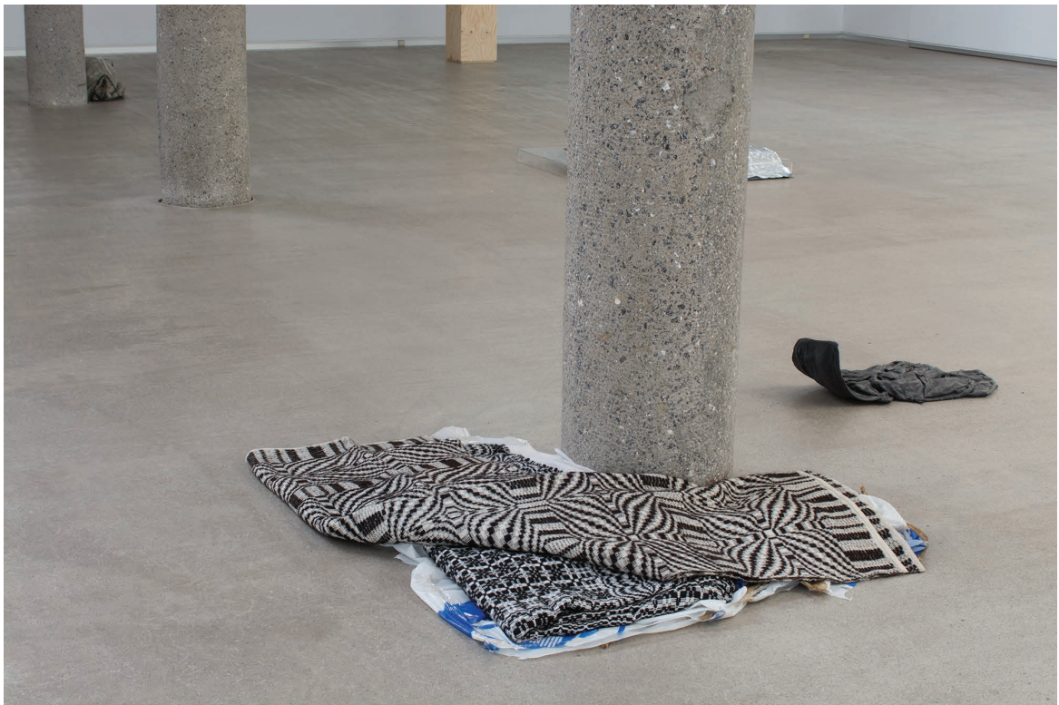
Bilbao (escayola) , 2017. Plaster and steel, 38x33x47cm Installation view