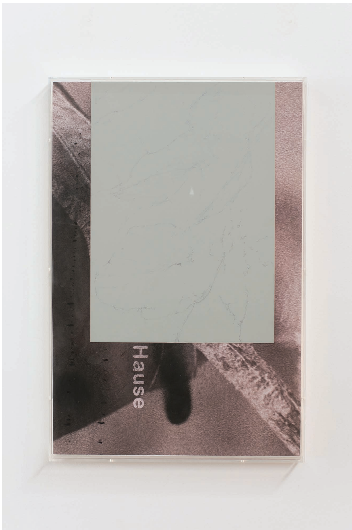
Bilbao (Nomadismus) #15. 2017. Collage and acrylic, 62x41x5cm