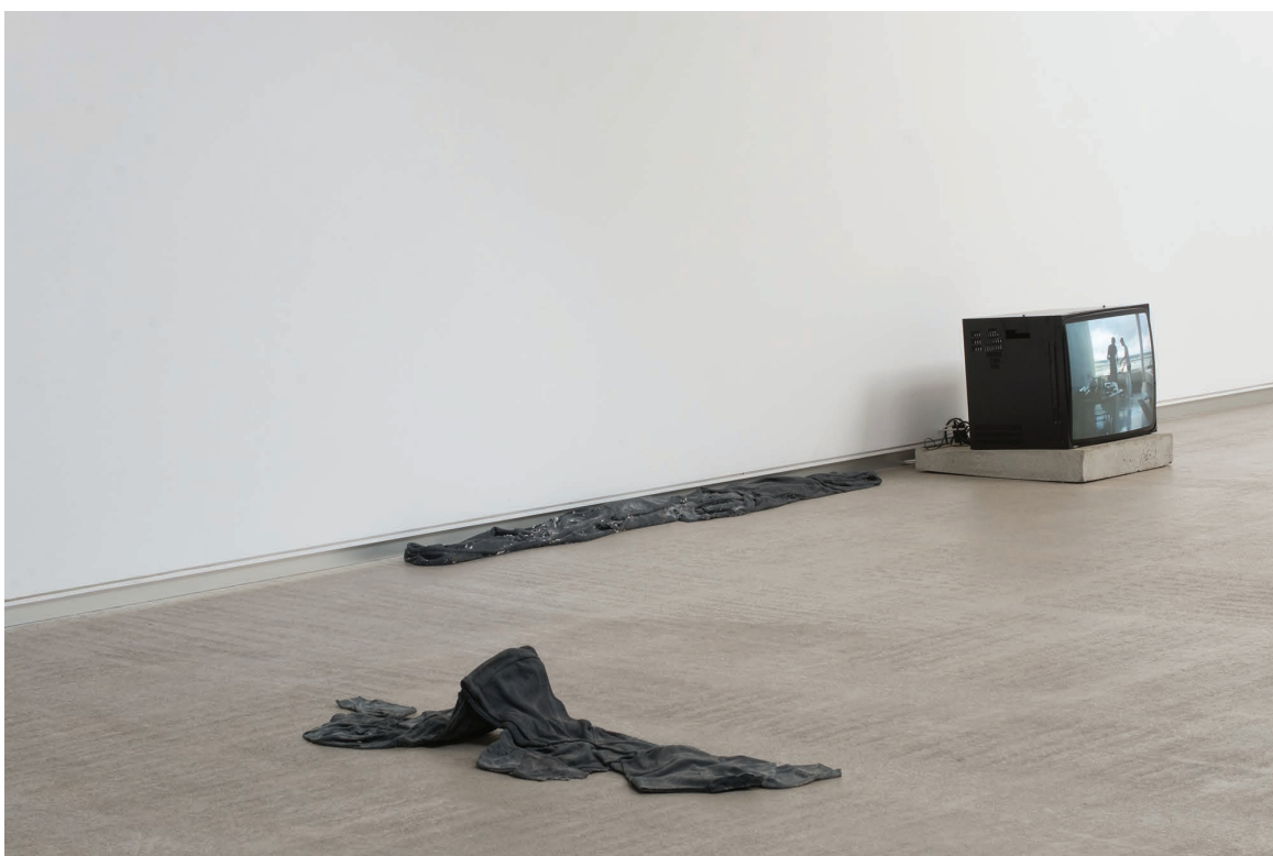
Bilbao (Cuadrilla 2) #18 , 2017. Textile and silicone, 14x20x39cm Installation view