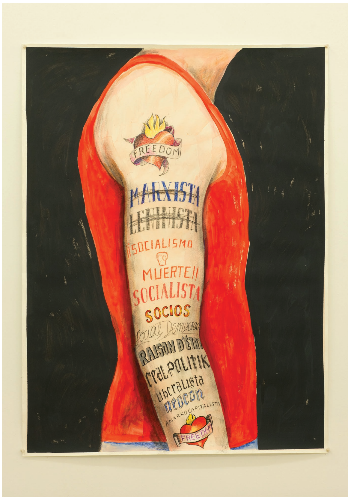
Serie tatuajes. Mixed media over fabric. 100x75.