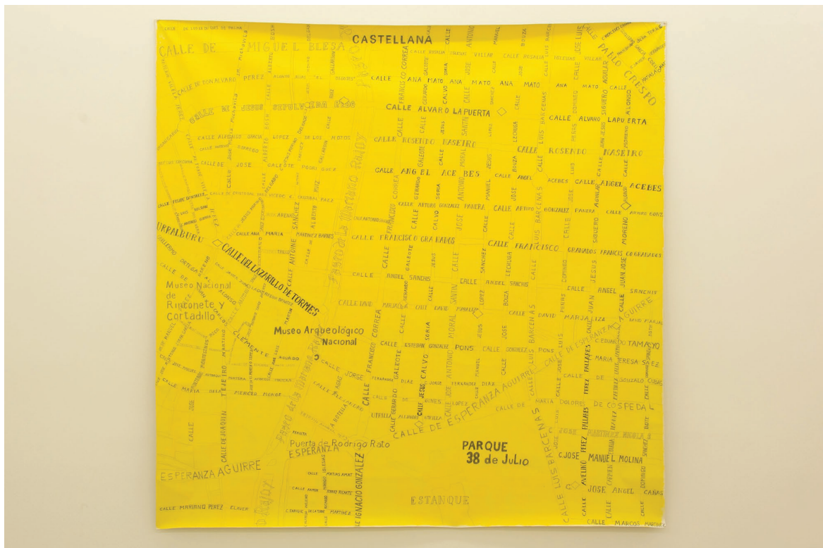
Ciudades ideales , 2016. Pencil over fabric, 215x213.