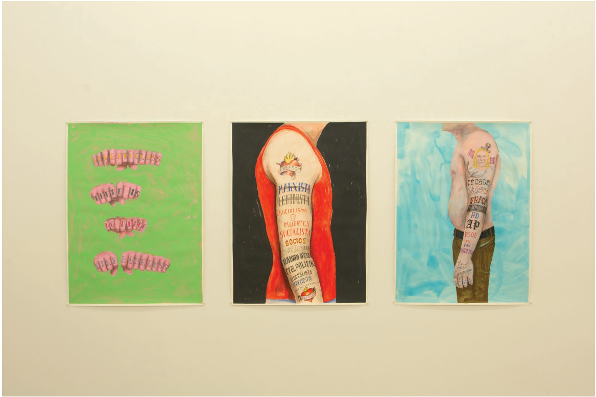
Serie tatuajes . Mixed media over fabric. 100x75.