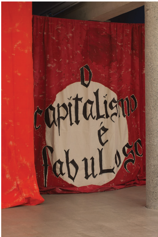
Death letter. Installation, mixed media- paint over fabric and video.