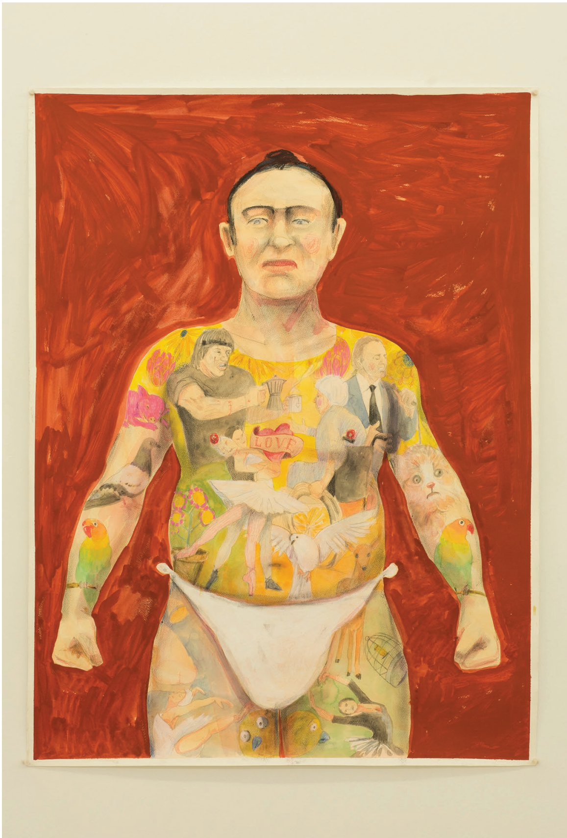
Serie tatuajes . Mixed media over fabric. 100x75.