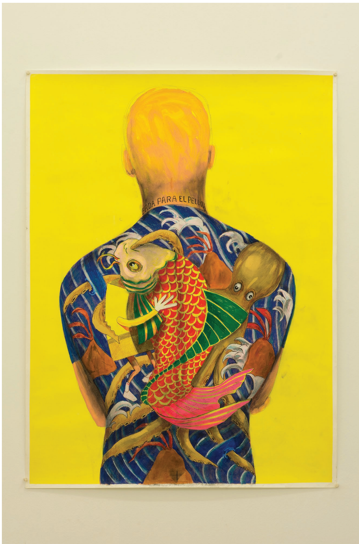
Serie tatuajes. Mixed media over fabric. 100x75.