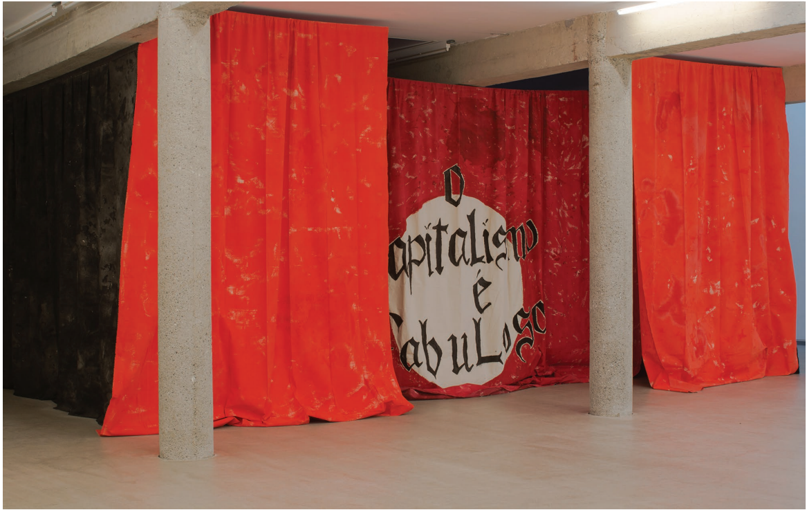
Death letter. Installation, mixed media- paint over fabric and video.