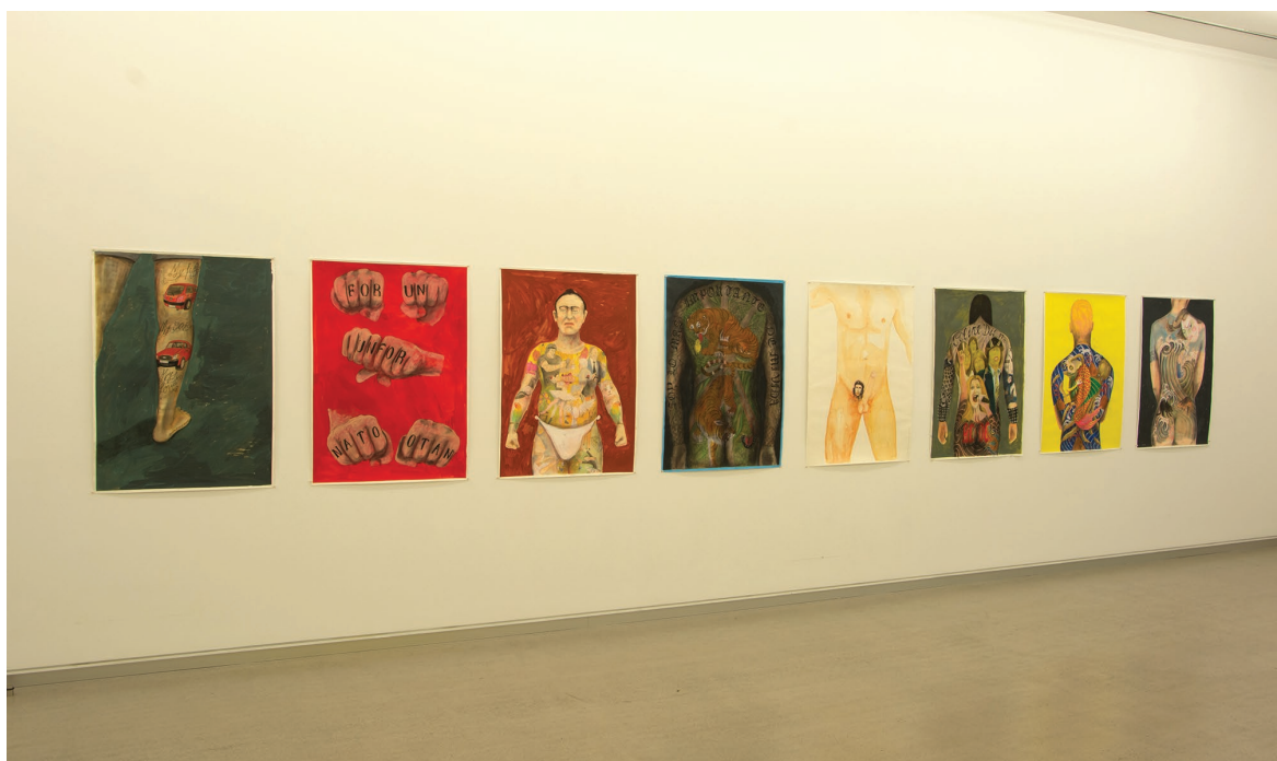
Ciudades ideales , 2016. Pencil over fabric, 154x210. Tatuajes . Pencil over fabric 100x75.