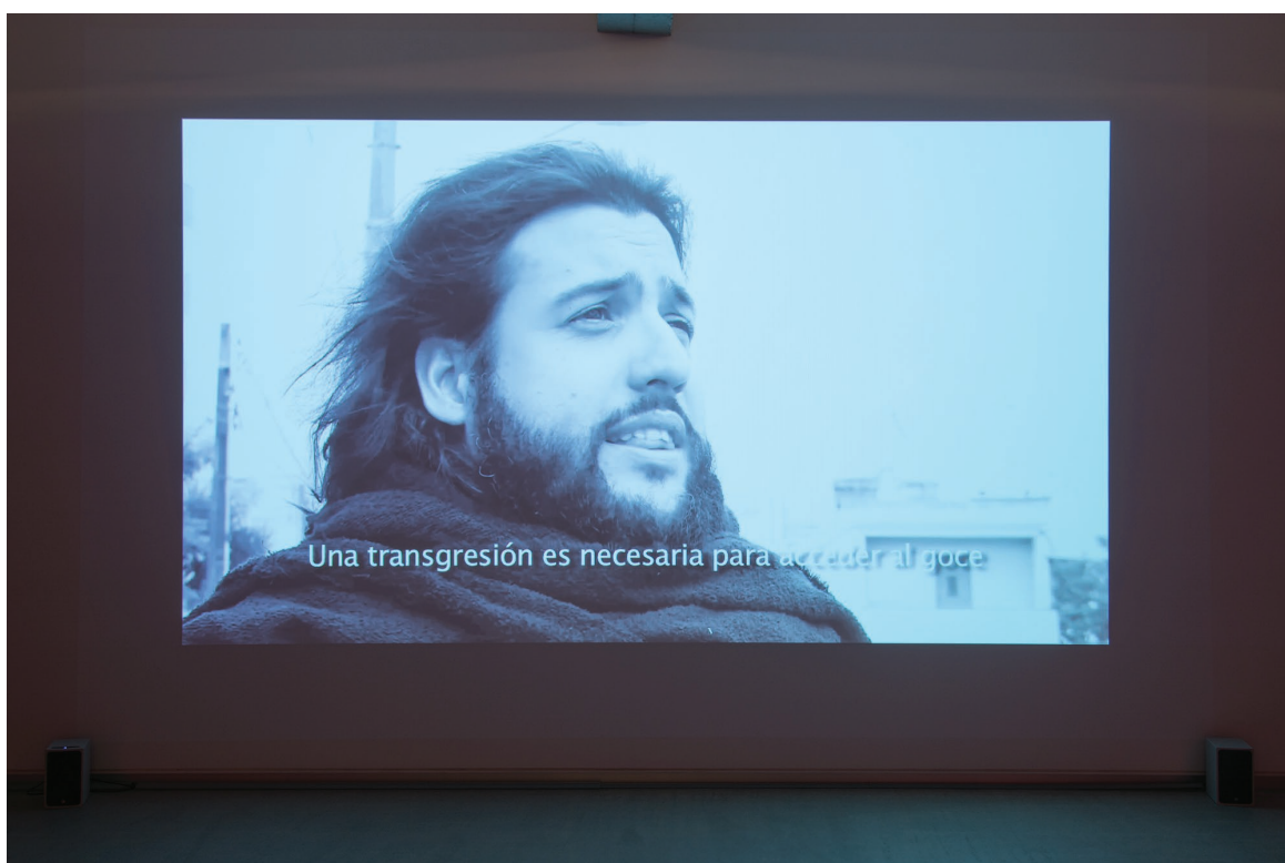
Death letter , 2014. 30', b&n