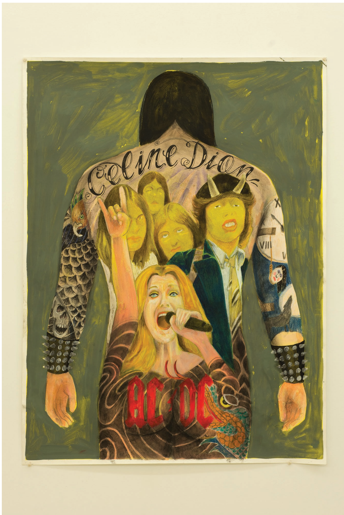
Serie tatuajes. Mixed media over fabric. 100x75.