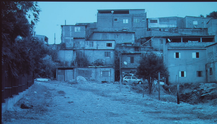
Death letter , 2014. 30', b&n