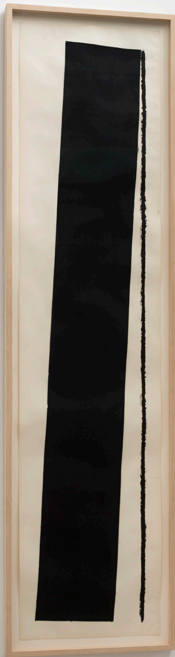
UNTITLED (SIGHT POINT) , 1975 Oilstick on paper. 255 x 60 cm.