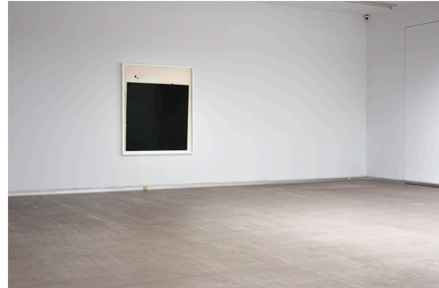
BILBAO JUNGLE , 1983 Oilstick on paper. 150 x 127 cm.