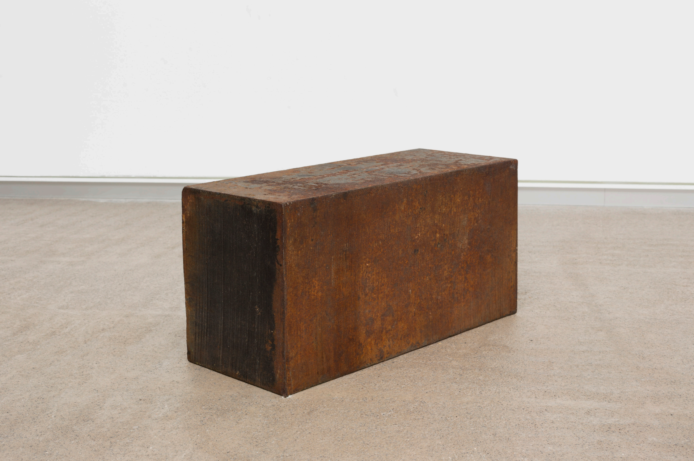
THREE UNEQUAL ELEVATIONS , 1975. Forged steel. 3 blocks, 61 x 31 x 25, 61 x 31 x 27, 61 x 31 x 29 cm. (detail)