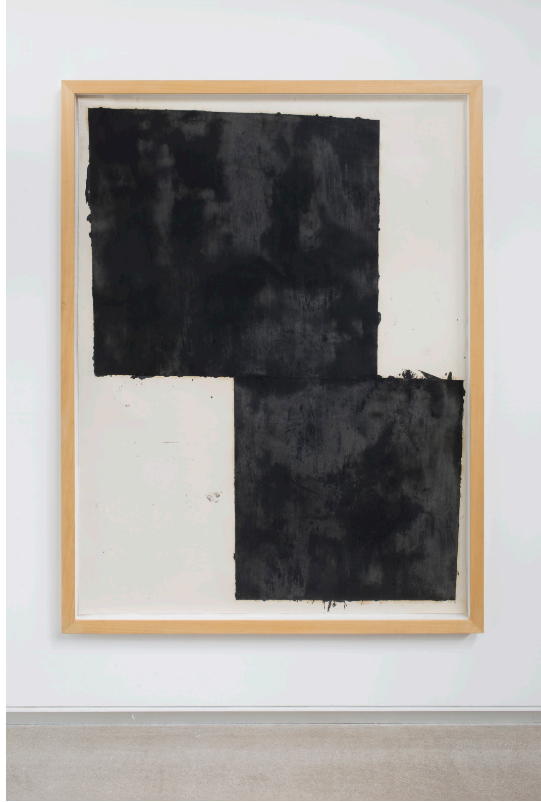
TUJUNGA CUT , 1983 Oilstick on paper. 196,5 x 147 cm.