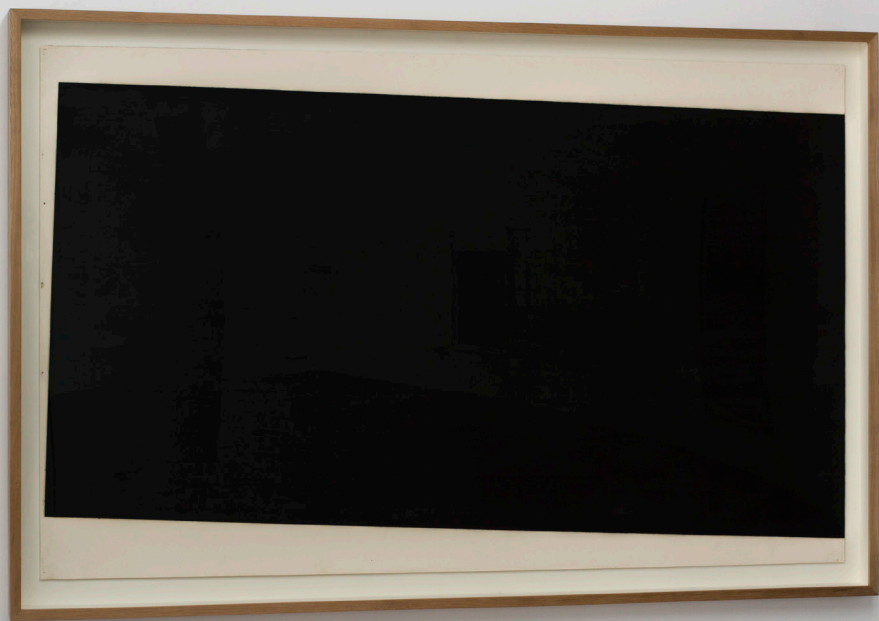
Untitled, 1985. Oilstick on paper. 126 x 203 cm.