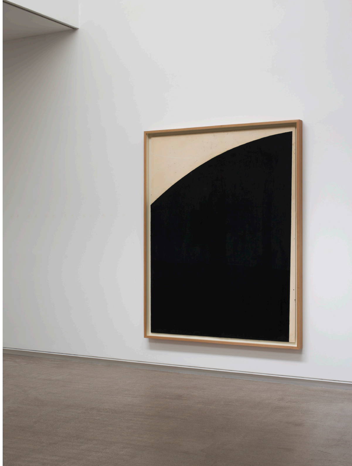
C.C. IV , 1983-84 Oilstick on paper. 203 x 157,5 cm.