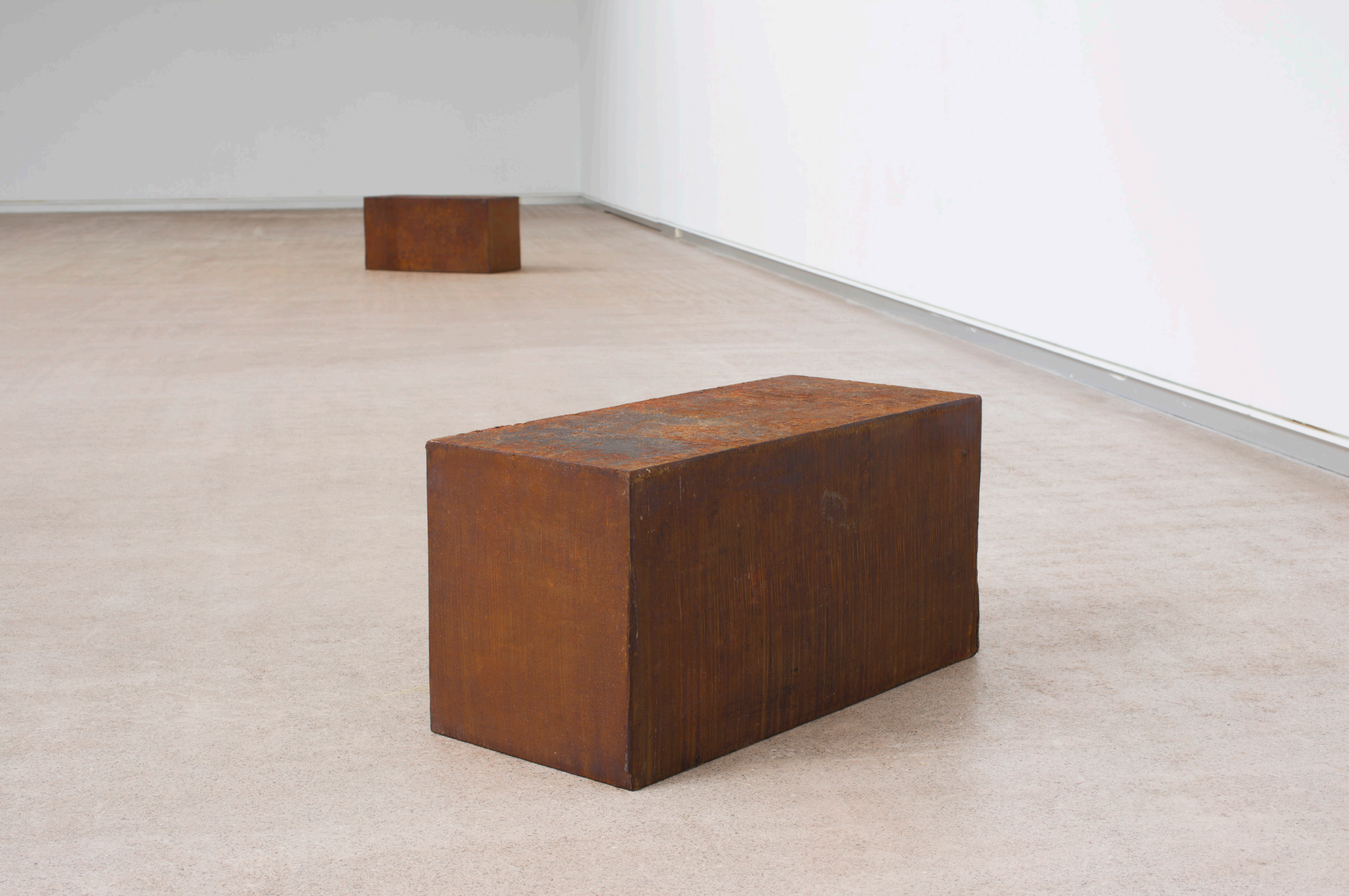
THREE UNEQUAL ELEVATIONS , 1975. Forged steel. 3 blocks, 61 x 31 x 25, 61 x 31 x 27, 61 x 31 x 29 cm. (detail)