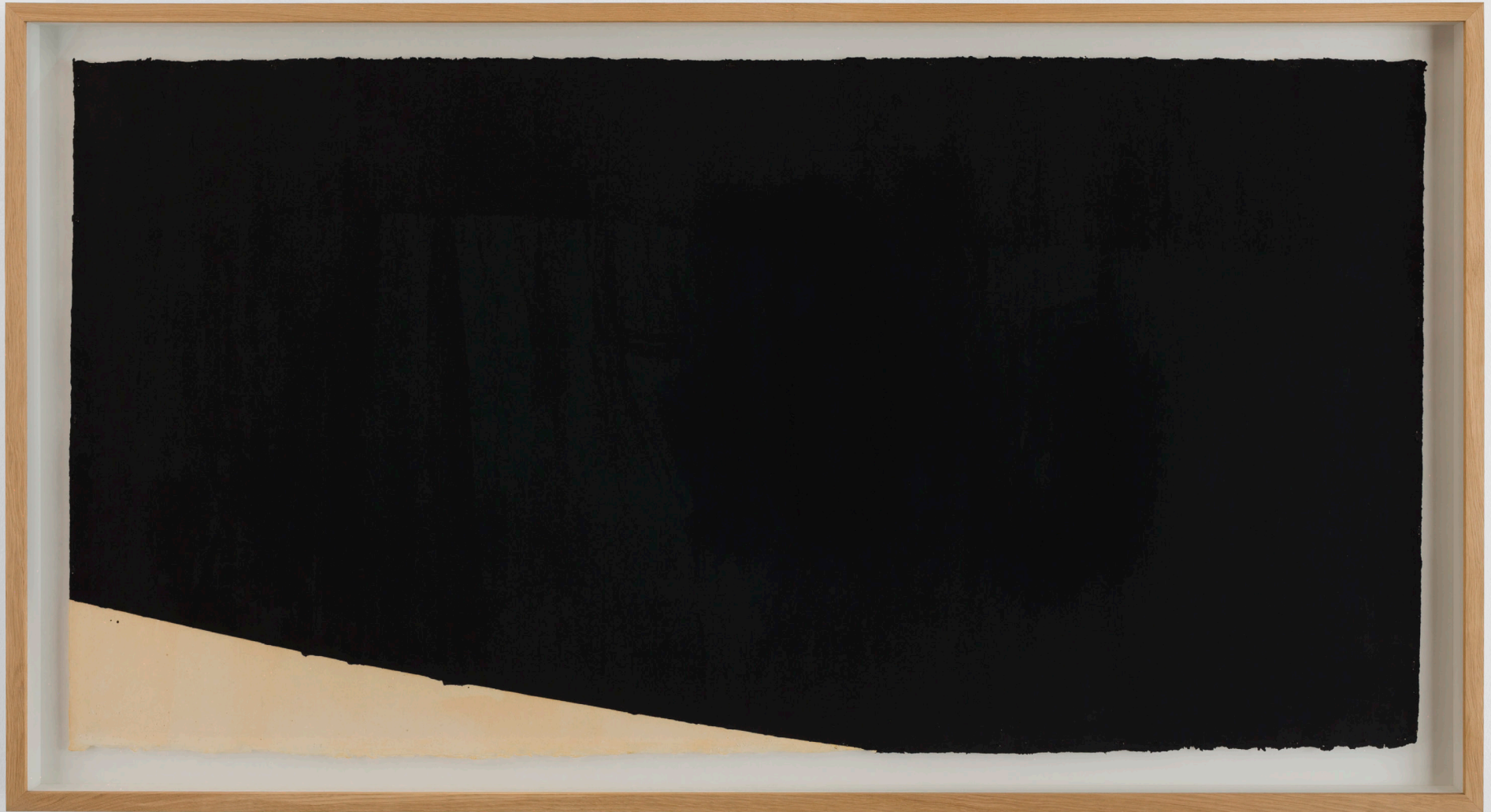
NOVA SCOTIA HORIZONTAL CURVE , 1986. Oilstick on japanese paper. 98 x 189,5 cm.