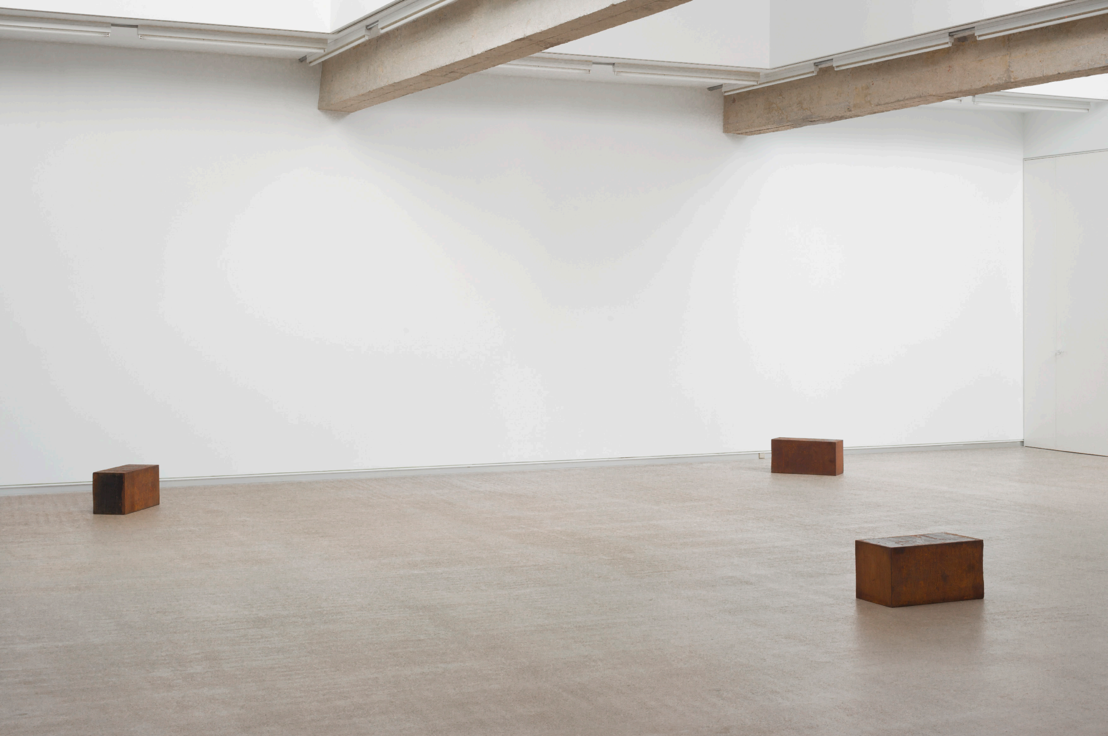
THREE UNEQUAL ELEVATIONS , 1975. Forged steel. 3 blocks, 61 x 31 x 25, 61 x 31 x 27, 61 x 31 x 29 cm.