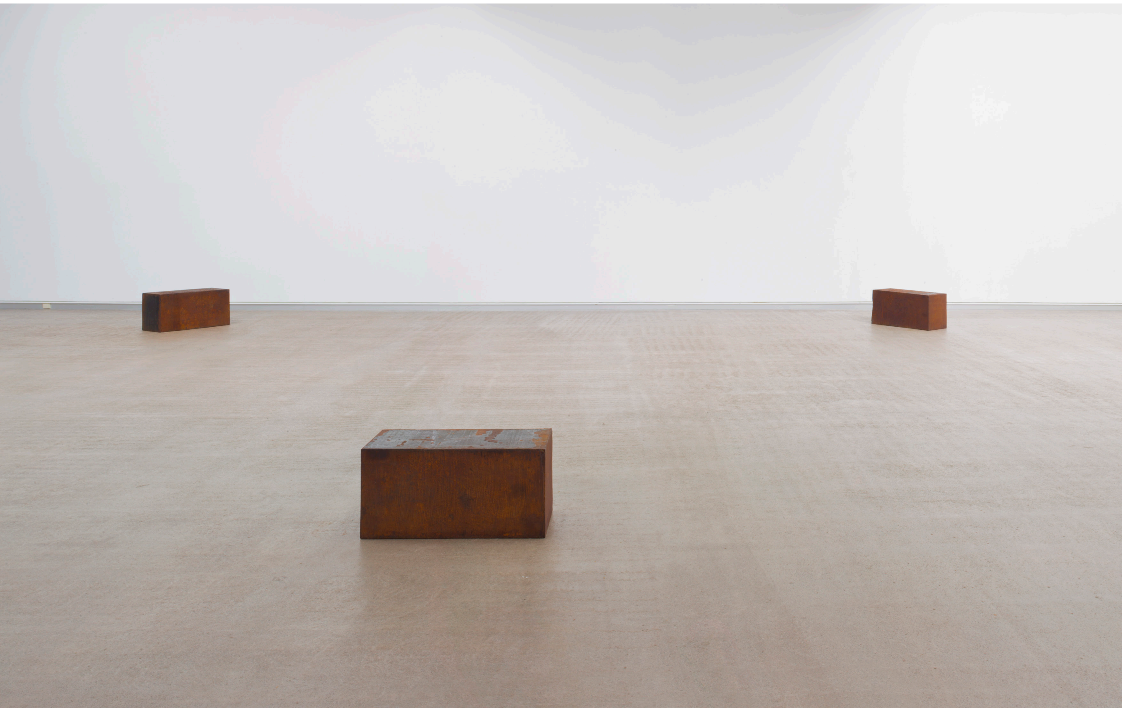
THREE UNEQUAL ELEVATIONS , 1975. Forged steel. 3 blocks, 61 x 31 x 25, 61 x 31 x 27, 61 x 31 x 29 cm.