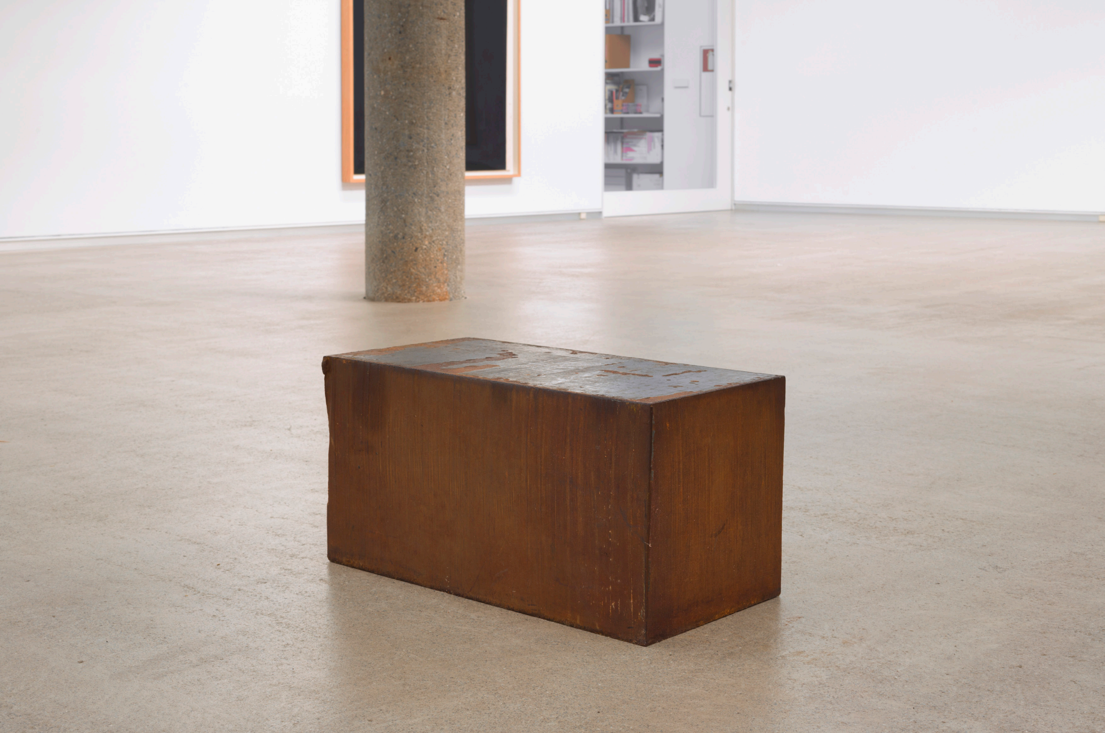
THREE UNEQUAL ELEVATIONS , 1975. Forged steel. 3 blocks, 61 x 31 x 25, 61 x 31 x 27, 61 x 31 x 29 cm. (detail)