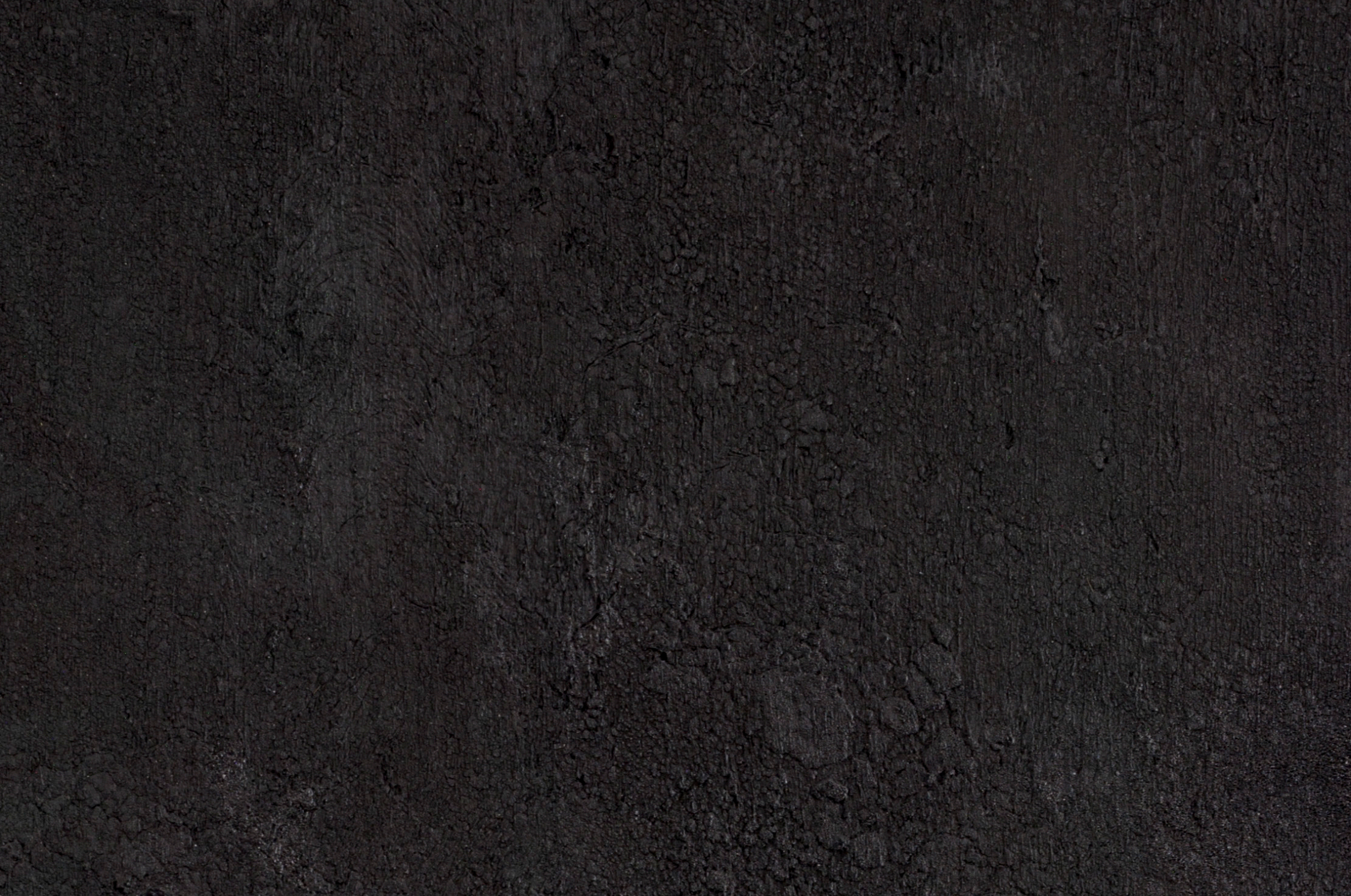
FEDERAL PLAZA 1 , 1984. Oilstick on japanese paper. 193 x 101,5 cm. (detail)