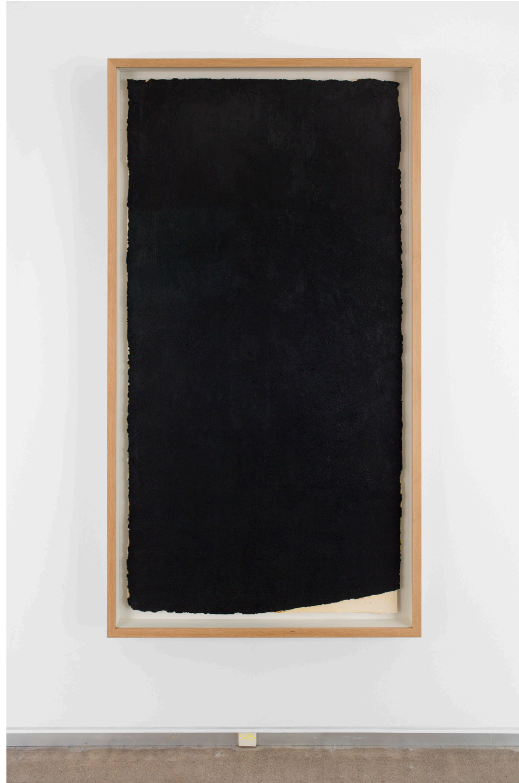
FEDERAL PLAZA 1 , 1984 Oilstick on japanese paper. 193 x 101,5 cm.